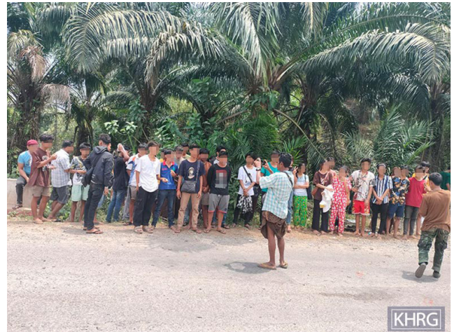
These photos were taken in March 2024 in Z--- village, Sa Tain village tract, Ler K'Saw Township, Mergui-Tavoy District. After the SAC announced the conscription law in February 2024, many young villagers from several villages in Sa Tain village tract were afraid to travel out of their villages, fearing arrest and forced conscription by SAC soldiers. Many of those young villagers fled to forests and had to sleep there to avoid encountering SAC soldiers. Some young villagers fled to Thailand. This photo shows a group of young villagers who are making their journey to Thailand to avoid conscription. In the photo, soldiers from local armed resistance groups were checking and questioning the young villagers on the road, as they were travelling through a mixed-controlled area.

arrested [outside of the village tract]. After the conscription law was announced, they do not travel to towns anymore. They know that they could be arrested if they travel to towns. 39 He added: "As far as I know, two days after the conscription law was announced [by the SAC], we saw young people were travelling every day on a main road in our area. At least 10 or 20 cars full of young people were passing through the road per day. I think they [those young people] could be travelling to Thailand [to avoid forced recruitment] or they could be travelling to seek refuge in our area [KNU-controlled areas]. [...] I think most of those young people are from towns and cities such as Mawlamyine and Mudon."