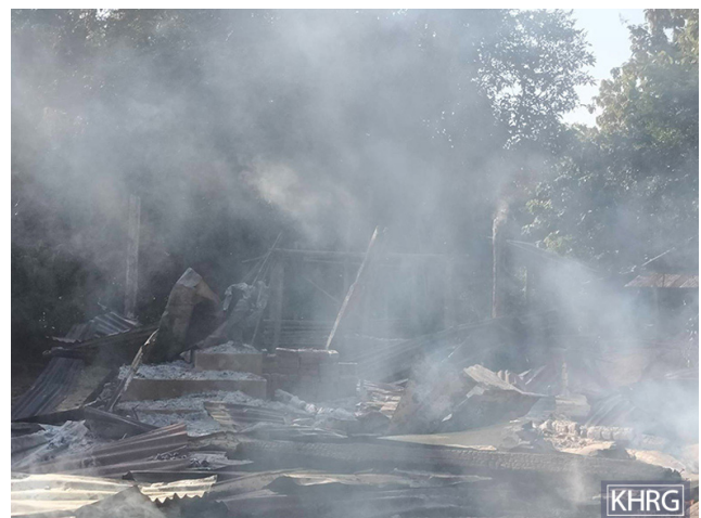
These photos were taken in January 2024 in Ah--- village, Day Loh village tract, Htaw Ta Htoo Township, Taw Oo District. On January 8 th 2024, at around 6 pm, the combined forces of the KNLA and PDF attacked SAC LIB #39 army camp which is based in Lay Maing area, Thandaunggyi Road, Taw Oo District. At around 9 pm, SAC LIB #39 and other SAC troops from Kon Nit Maing army camp fired 13 mortar rounds into five villages including Ai--- village in Day Loh village tract. On January 10 th 2024, at around 10 am, the SAC LIB #39 went to Ah--- village, and they burned down 17 villagers' houses in the village. These photos show some villagers' houses that the SAC burned down in Ah--- village.