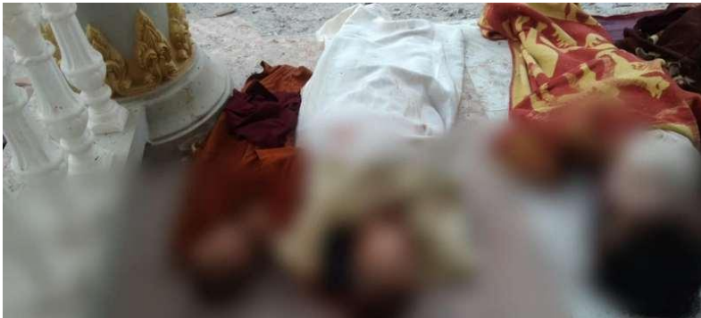
Young novices shot dead by SAC aircraft machine guns

The bombing damaged four monastery buildings, including the main temple, a monk hostel and two novice hostels. Three cars and two nearby houses were also damaged. There were five monks and 60 novices (aged 5 to 16) living at the temple, and over 200 IDPs from Nawngkhio town, who slept there at night for safety. There were no armed personnel staying at the monastery.