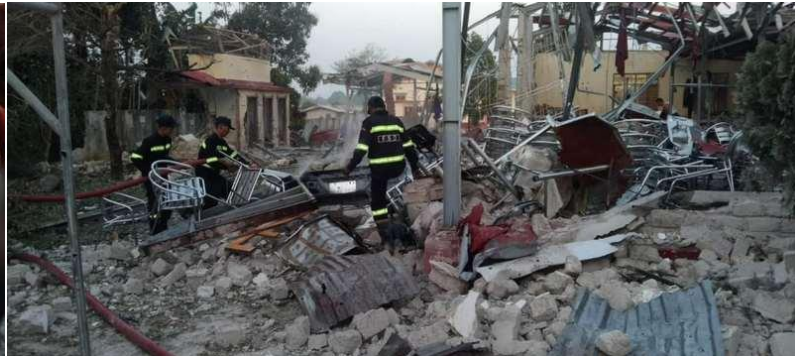
Sein Yadana Parayatti monastery building destroyed by SAC 250 lb bombs