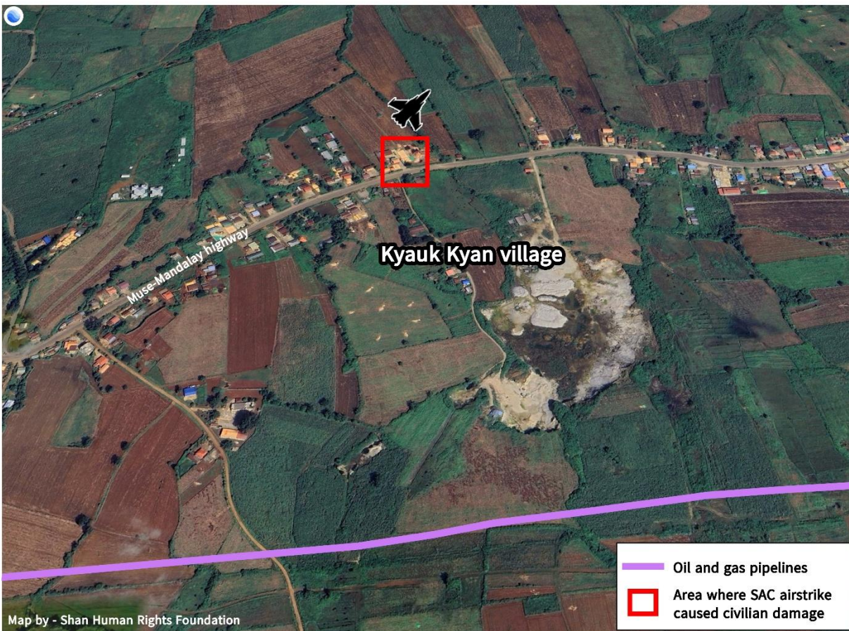
SAC airstrike on Kyauk Kyan village on March 17, 2025

On March 17, at 11:45 am, two SAC fighter jets dropped two bombs and fired machine guns into Kyauk Kyan village, five kilometers west of Nawngkhio town. The bombs fell about 700 meters from the Chinese oil and gas pipelines. Several houses were damaged by the bombing.