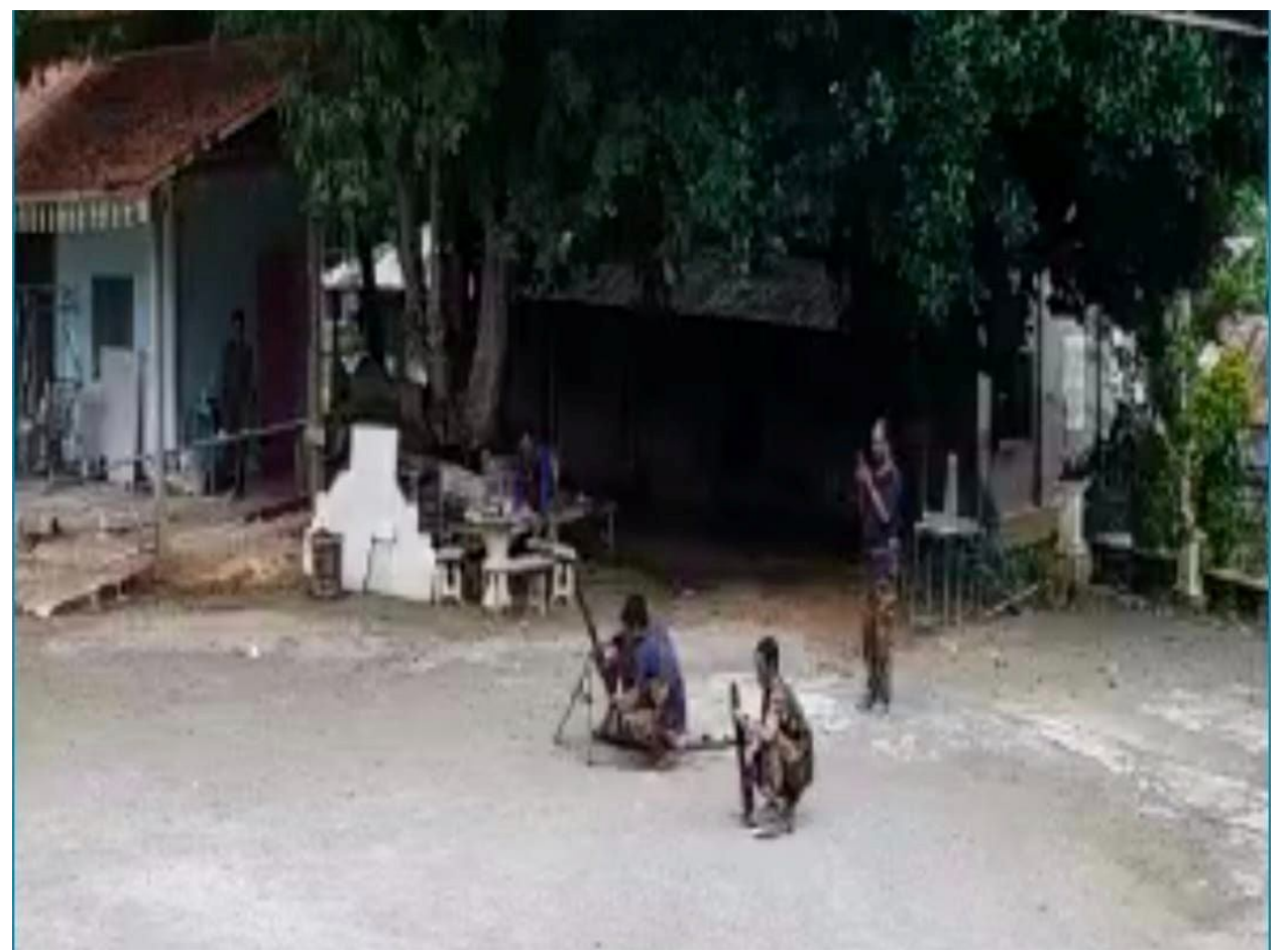
SAC troops in Koon Kawk temple compound

On October 10, from 1:30 pm to 2 pm, SAC troops encamped in Koon Kawk temple compound fired shells into the surrounding hills where KIA troops were staying.