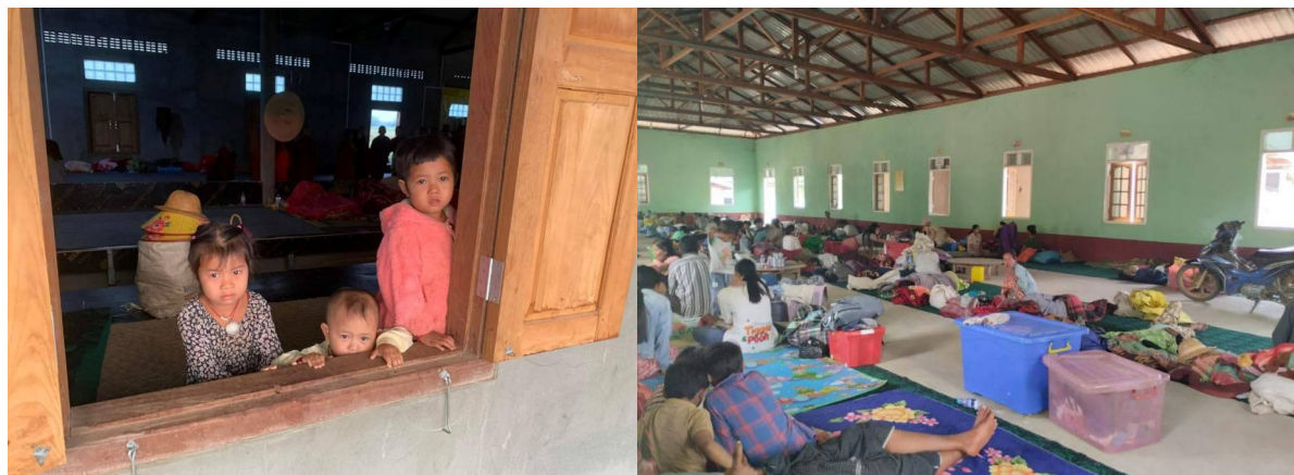
IDPs taking refuge at village temple west of Nawng Khio town

The military situation remains tense in northern Nawngkhio township, where SAC troops have set up camp in Than Po and Ho Khai villages. About 4,000 local villagers from the village tracts of Than Po, Kone Gyi, Pan Pwe and Doe Pin have fled their homes to take shelter in the towns of Nawngkhio, Kyaukme and Pyin Oo Lwin, mostly staying with relatives. Some have taken refuge in nearby village temples.