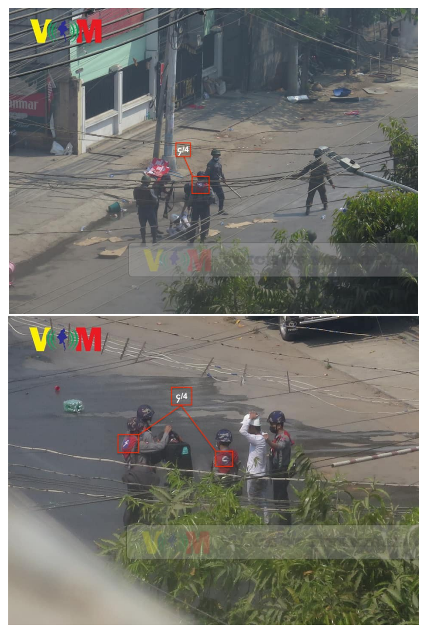
Figure 12: Additional imagery uploaded alongside images of the protest and the individual being beaten (source: <u>Voice of Myanmar</u>).