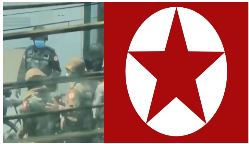
Figure 5: Verification of the military patch worn by the personnel in the video. [Left] still from the video [Right] image identified from <u>Wikipedia images.</u>

The military personnel involved in the incident are wearing a patch on their left arms. Myanmar Witness has been able to identify this as the Yangon Division of Operation Command Headquarters No. 4. Visual confirmation of the match can be seen in Figure 5.