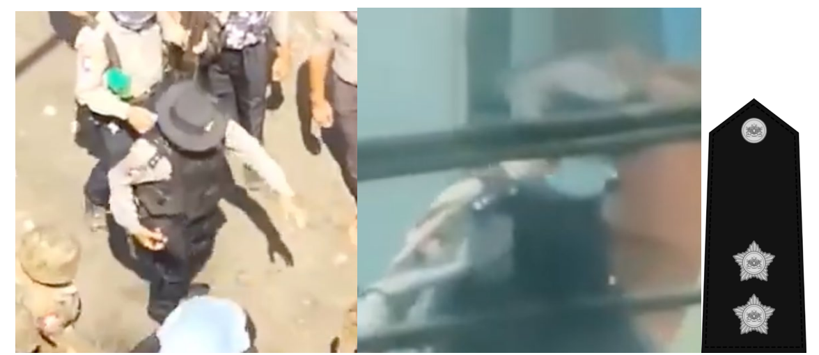
Figure 4: Enlargement of police officer rank as seen on his shoulder. [Right] image identified from Wikipedia images.

The military personnel involved in the incident are wearing a patch on their left arms. Myanmar Witness has been able to identify this as the Yangon Division of Operation Command Headquarters No. 4. Visual confirmation of the match can be seen in Figure 5.