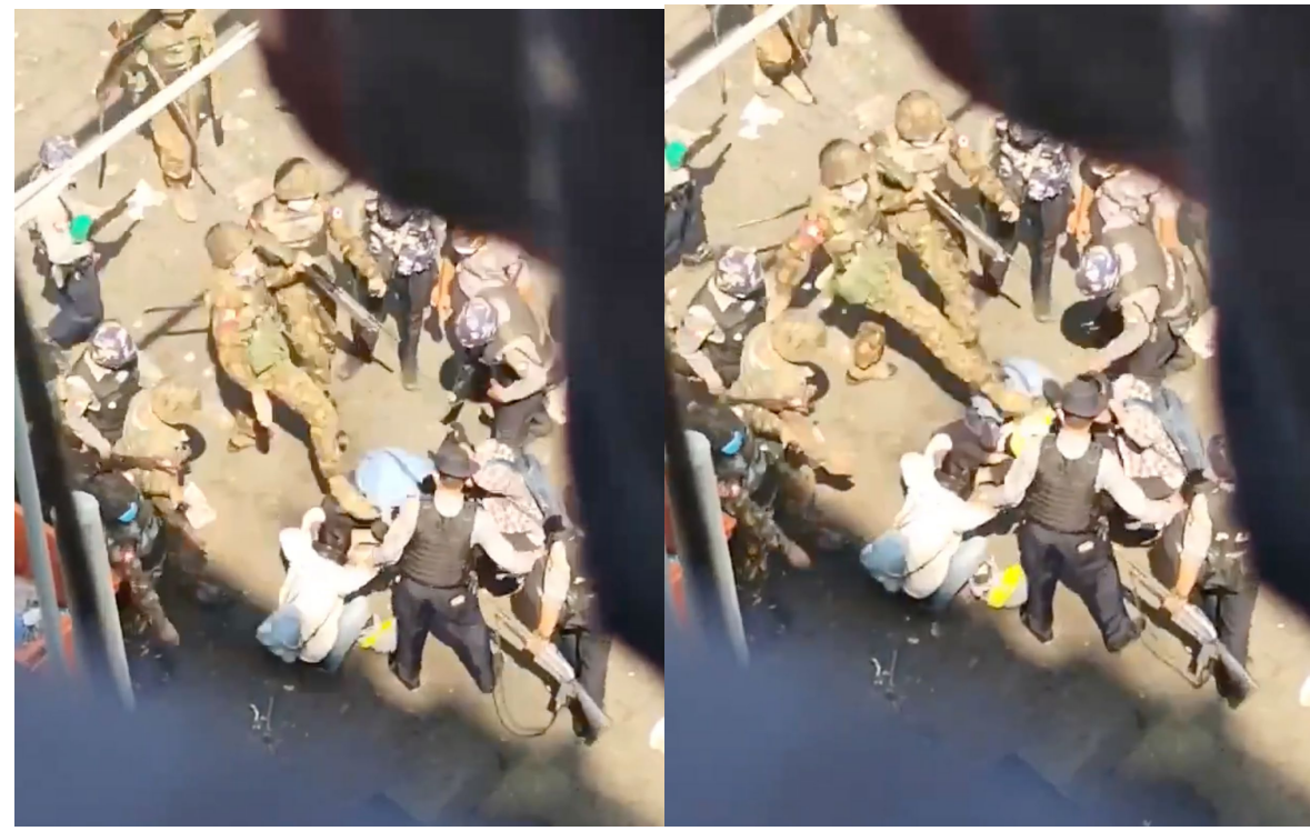
Figure 1: Stills from the video showing security forces beating detained individuals.

Additional <u>footage</u> allegedly from the same day shows the same group of people from a different angle. Multiple protests did occur on this day in Yangon; however, Myanmar Witness cannot confirm that these individuals were protestors or engaged in protest. Below is a comparison of two stills from the two alternative videos showing the same people - identified within both images by coloured boxes.