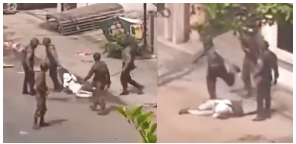
Figure 6: Stills from the video footage showing the police and military personnel kicking and stomping on the body.

Myanmar Witness identified multiple videos and images showing several angles of this specific incident. In the first video, the group of Myanmar military personnel and police are seen kicking the body (source redacted due to privacy concerns), and in the second <u>video</u> they are seen dragging the body away.