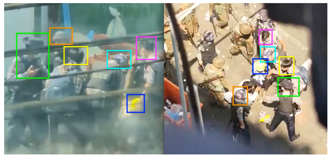
Figure 2: Verification of the incident by cross-referencing separate source videos.

Additional <u>footage</u> allegedly from the same day shows the same group of people from a different angle. Multiple protests did occur on this day in Yangon; however, Myanmar Witness cannot confirm that these individuals were protestors or engaged in protest. Below is a comparison of two stills from the two alternative videos showing the same people - identified within both images by coloured boxes.