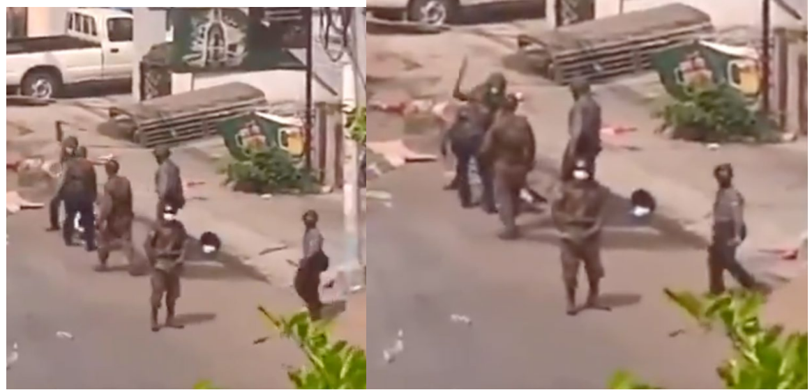
Figure 7: Stills from the video footage showing the detainee being beaten further

Additional images <u>shared</u> by the Voice of Myanmar show the same individual on the floor as the Myanmar police beat him.