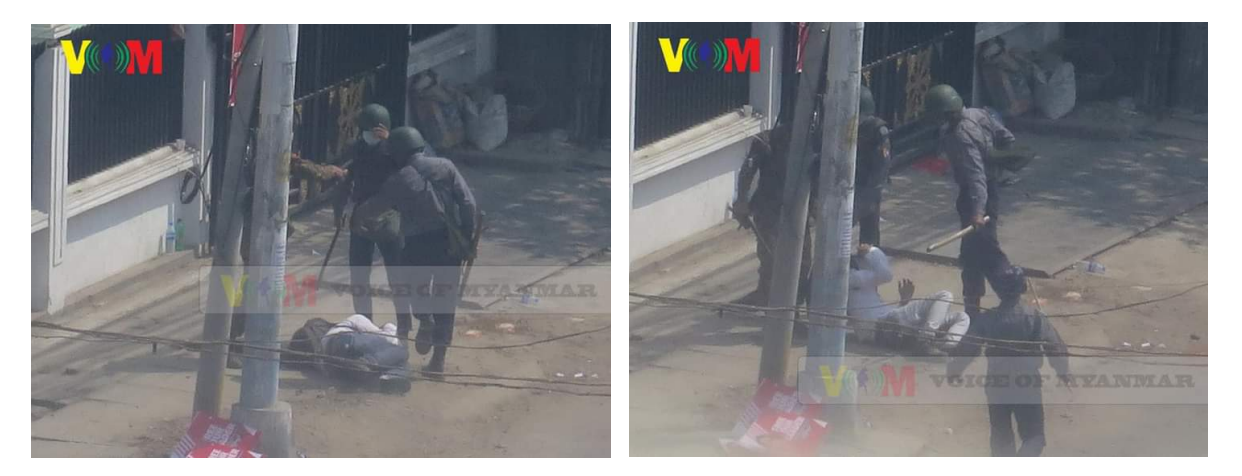
Figure 8: Additional images of the same individual on the ground, being beaten by military personnel

Additional images <u>shared</u> by the Voice of Myanmar show the same individual on the floor as the Myanmar police beat him.