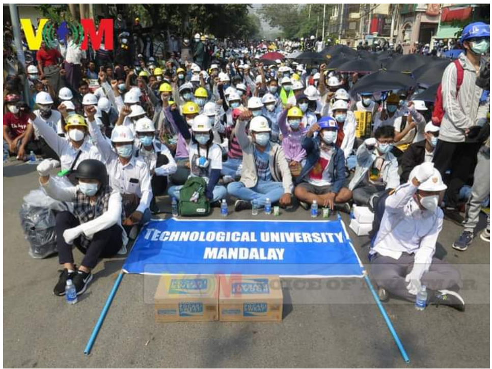
Figure 10: Students from Mandalay's Technology University, allegedly at the multi-school strike in Mandalay on 7 March 2021.

Other images shared on the same day show students from Mandalay's Technology University protesting, wearing similar white outfits and helmets as the individual being beaten in the figures above.