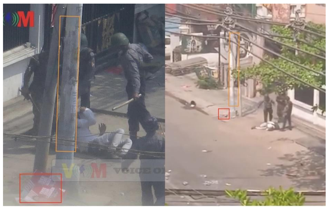
Figure 9: Visual confirmation showing that the individual shown in the Voice of Myanmar images and the Khit Thit Media video is the same. [Left] Voice of Myanmar image, [Right] Khit Thit Media video.

Other images shared on the same day show students from Mandalay's Technology University protesting, wearing similar white outfits and helmets as the individual being beaten in the figures above.