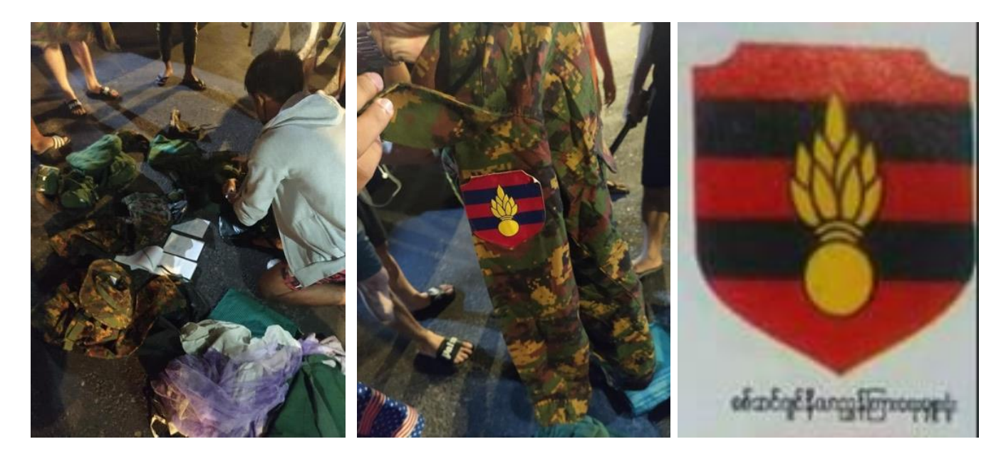
Figure 4: [Left and Middle] Photos from the Facebook post showing the crowd searching through items found in the vehicles. A uniform with a distinctive insignia was among the items found. [Right] The insignia from an image identifying different Burmese military units.

~0030: According to social media posts from individual accounts, an hour later at around 0030 on 9 March, police and military returned to the area and went from building to building, arresting civilians. Photos and videos posted on social media at the time can be geolocated to 2nd and 3rd Streets, Lanmadaw.