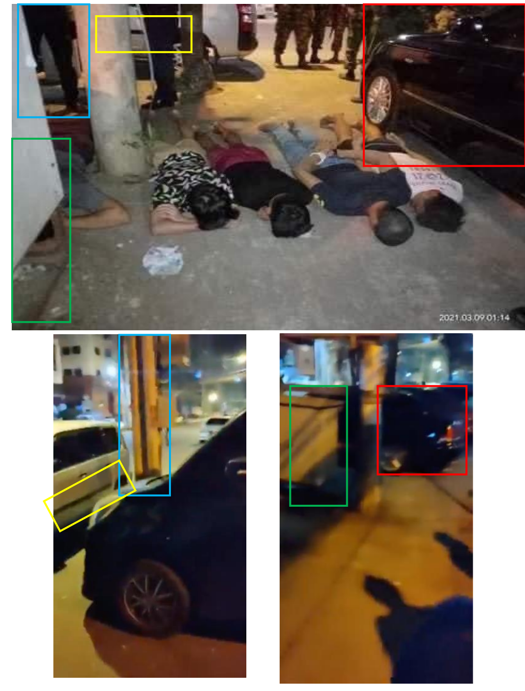
Figure 6: [Top] Photo showing men detained. Military-uniformed men can be seen in the background (Source: <u>Twitter</u>). [Bottom Left] Capture (12:20) from the Facebook Live Video showing white vehicle with black band (source: the link has since been removed, however this content was archived by Myanmar Witness). [Bottom Right] Capture (13:34) from the Facebook Live Video showing the rear of a black saloon (source: the link has since been removed, however this content was archived by Myanmar Witness).

Image 17: Photo from social media showing the detained men. A grey vehicle is visible on the right (<u>Twitter</u>)