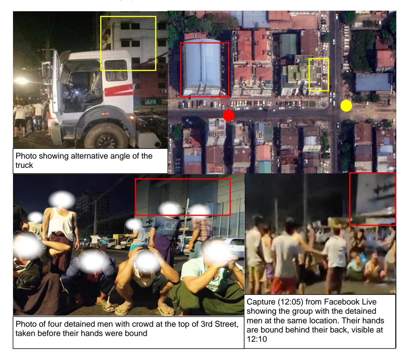
Figure 3: Still images captured from the Facebook Live Video used to geolocate the events (source: the link has since been removed, however this content was archived by Myanmar Witness).

Photos <u>posted</u> to social media and verified by Myanmar Witness corroborate the events in the video, showing the five men 'detained' by the activists, as well as the vehicles and materiel recovered from the grey car.