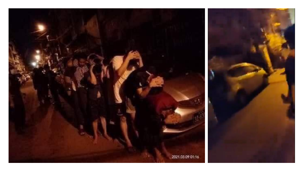
Figure 7: [Left] Image posted on twitter. [Right] Capture (13:39) from the Facebook Livestream showing a possible match for the vehicle near the top of 3rd Street.

~0116: A second photo released in the same <u>Twitter</u> post, timestamped at 0116, shows another group of men lined up with their hands behind their heads. The dark image is difficult to geolocate, even after brightening with photo-editing software. The width of the street and parking is consistent with 3rd Street and the vehicles are possible matches with those seen at the top of 3rd Street in the Facebook live stream. The timestamp is also consistent with the previous image. While Myanmar Witness cannot verify with absolute confidence, it is likely that the image was taken near the north end of 3rd Street.