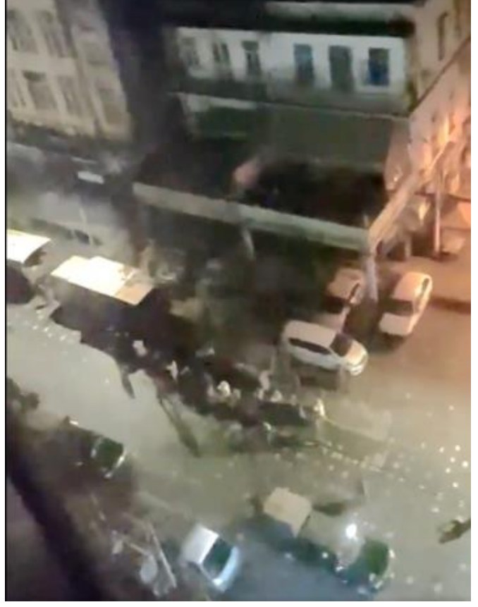
Figure 8: [Top] Capture (00:03) of a video showing men being marched along Anawrahta Road. [Bottom] Capture (00:01) of a video showing another angle of the detained men being led to the waiting trucks. (source redacted due to privacy concerns).