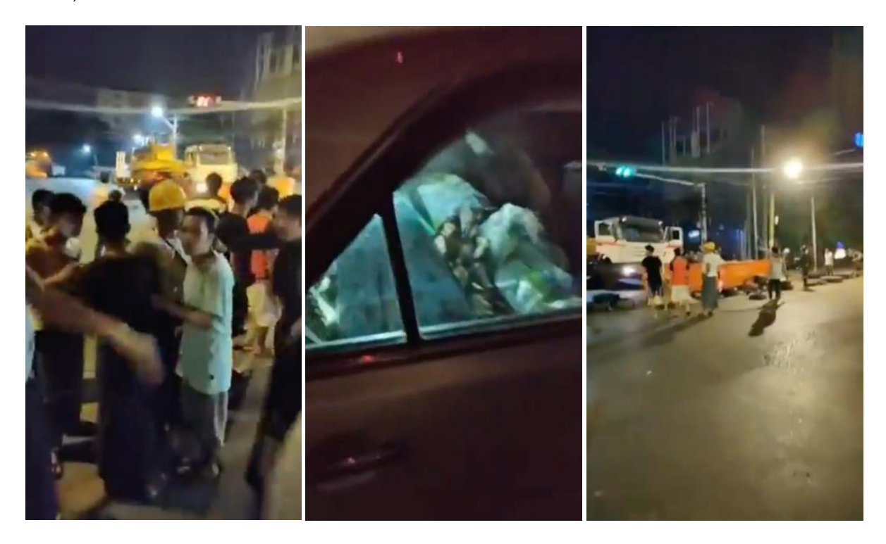
Figure 2: Captures from the Facebook Live Video. [Left] Capture (00:09) showing the white truck with a bulldozer on a trailer in the background at the junction. Note the doors are closed. [Middle] Capture (00:18) showing materiel in the backseat of the grey car. [Right] Capture (00:56) showing the truck doors now open. They can be seen open from the 44 second mark, when the crowd start shouting and moving towards the vehicle.

On the north side of the junction, a large truck towing a bulldozer is parked. At the 00:44 minute mark in the live stream, it appears the individuals inside the truck try to escape; the doors open and the crowd then run towards the truck and then north up the street, apparently in pursuit of the truck's occupants. At the 02:17 minute mark, a man who had remained in the truck is seen being restrained by several civilians next to the vehicle. At 02:55, another man is escorted back from the street to the north.