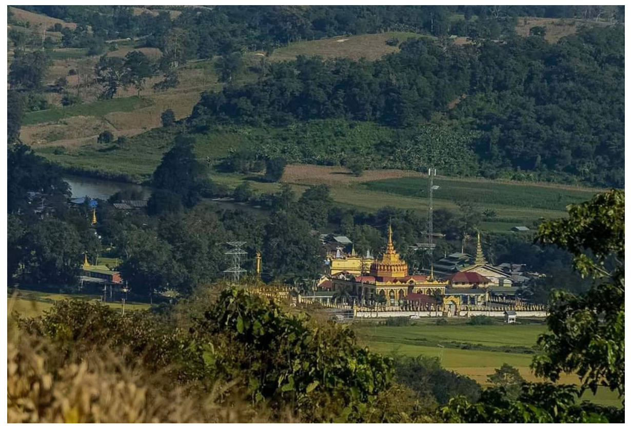
Bawgyo Pagoda beside Namtu river

However, since the formation of the committee in December, local communities have received no further information about which areas in these tracts will be flooded.