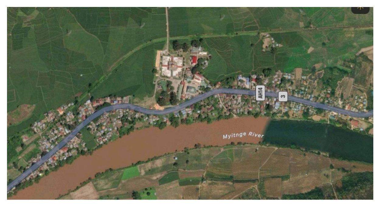
Bawgyo village situated by the Namtu river bank and the historical Bawgyo pagoda

One of the impacted village tracts is Baw Gyo, where locals fear that numerous houses along the river bank and historical sites such as the Baw Gyo pagoda will be submerged.