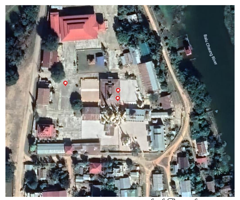
Figure 26: Mapped impact locations in Mwedaw Pagoda (မွေတော်ဘုန်းကြီးကျောင်း). Created with Google Earth

Myanmar Witness investigators analysed UGC and identified three impact areas in the Mwedaw pagoda (see figure 26). Footage collected by Myanmar Witness showed that the building in the centre of the Mwedaw pagoda appeared to have suffered two hits, penetrating the ceiling by the pagoda's entrance. The hits were geolocated by Myanmar Witness to the southern section of the east side of the building. The shells have pierced the roof, causing destruction inside the building. The southern and western external walls of the building were barring signs of potential bullet holes, indicating the direction of the hit.