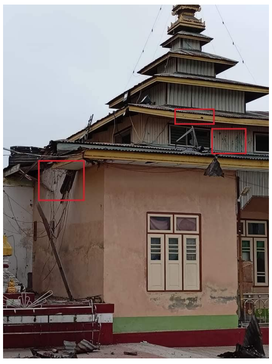
Figure 28: Signs of damage on the exterior wall of a building in Mwedaw Pagoda (မွေတော်ဘုန်းကြီးကျောင်း).

The third hit was recorded as fifty metres to the west of the other impacts, within the pagoda courtyard. UGC showed what are almost certainly multiple large blood puddles, footwear and clothing in the pagoda courtyard. What appears to be large blood stains were seen right by it, clothes soaked and pairs of footwear were inside the puddles. The surrounding surface appeared wet, potentially from a recent rain. However, the dust spread by the impact was dry, indicating the hit marks were caused very recently.