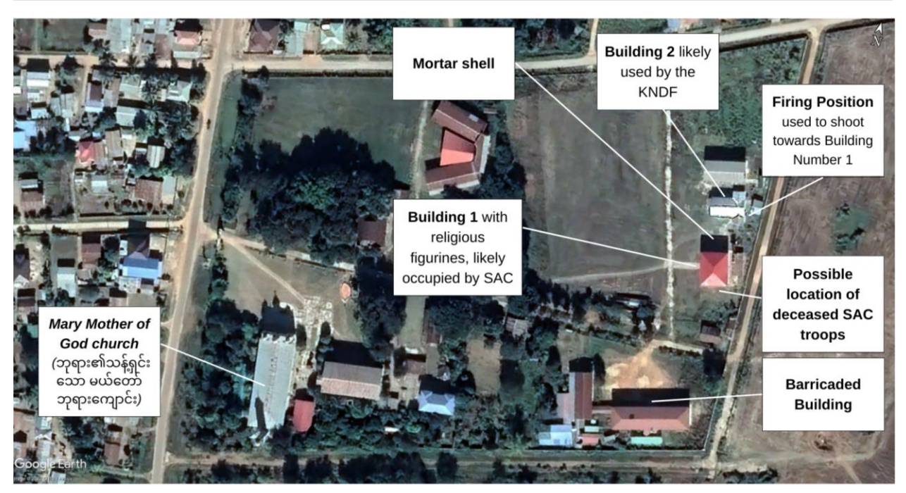
Figure 18: Annotated Google Earth Map showing the possible location of the deceased SAC troops, as well as other locations of interest, geolocated by Myanmar Witness.

For example, a <u>video</u> posted originally on 12 September 2022 (original high-resolution video redacted for privacy concerns, lower-resolution video uploaded on 14 September 2022 included), shows the inside of the building that Myanmar Witness believes the SAC bodies were found outside (building number 1 in figure 18). It shows Christian figures inside the building, suggesting it could be a place of worship. The video also shows the scale of destruction, possible blood stains and military equipment inside the building. Due to the presence of military equipment inside and the scale of the damage, it is likely that this building was occupied by SAC prior to their retreat. Additionally, a view from outside the window reveals an unexploded mortar in the ground, the same mortar was later retrieved by an allegedly KNDF member in a <u>video</u> posted on 15 September 2022 (location identified in figure 18).