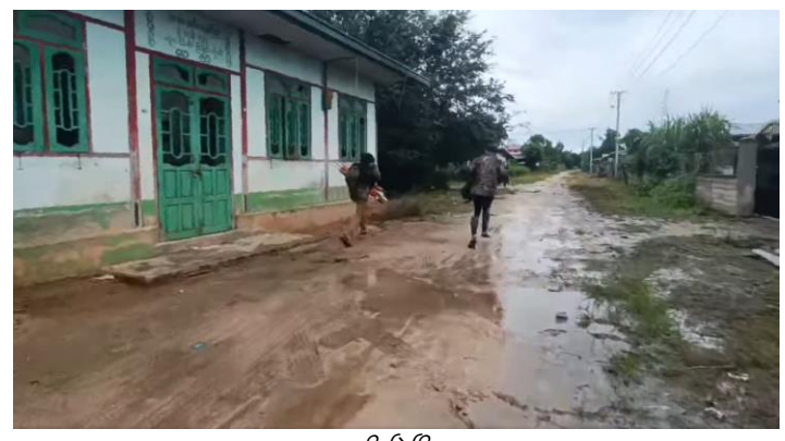
Figure 9: The library of Pwe Kone ward 3 in Moe Bye (မိုးမြို့) before it was destroyed (Source: screenshot from the original video, source redacted for privacy concerns. Additional, lower-resolution imagery can be found here: <u>Karenni Land Research</u>).

A <u>video</u> from Moe Bye, originally shared on facebook and later shared in lower-resolution on youtube, claimed to be from 9 September 2022, showed the attempted rescue of a wounded, unidentified local fighter. Myanmar Witness geolocated the casualty to 19.740661, 97.088343. At the start of the video, the Pwe Kone library (ward 3) is visible and does not appear to have any significant damage.