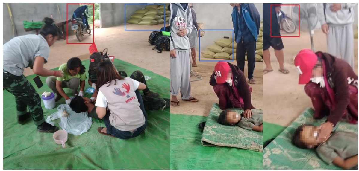
Figure 5: The child who was allegedly killed in Moe Bye (မိုးမြို့) in a medical facility operated by MPRT, posted on 9 September 2022

The child was seen undergoing medical examination but eventually he was pronounced dead. The open wound on his left hand was bandaged, as seen in footage showing his mourning mother.