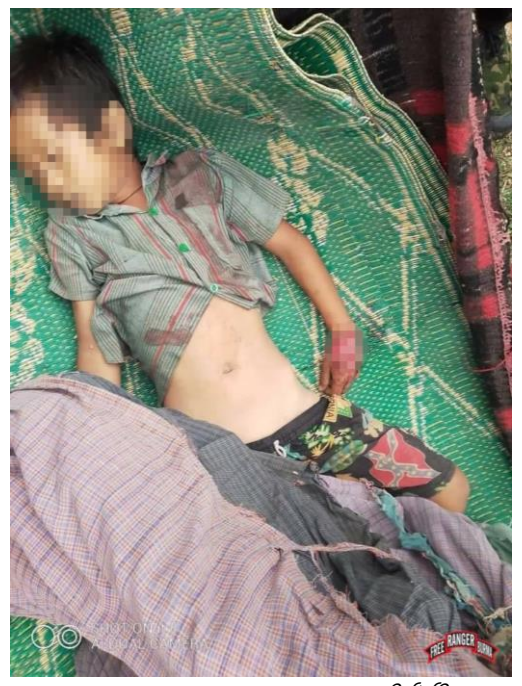
Figure 4: Image of the child who was allegedly injured in Moe Bye (မိုးမြို့), on 8 September 2022, but was later claimed to be pronounced dead (Source: Free Burma Rangers).

In a video posted on 9 September 2022 by MBPDF Branch Eagle, the child was carried by men in an unidentifiable uniform, allegedly to a medical facility operated by Mobye PDF Rescue Team (MPRT). The child appeared to be lying on a green mat, covered almost completely with a blanket. Another image from the rescue provided more details of the child's injuries; his shirt looked stained with blood and a deep injury was visible on his left hand.