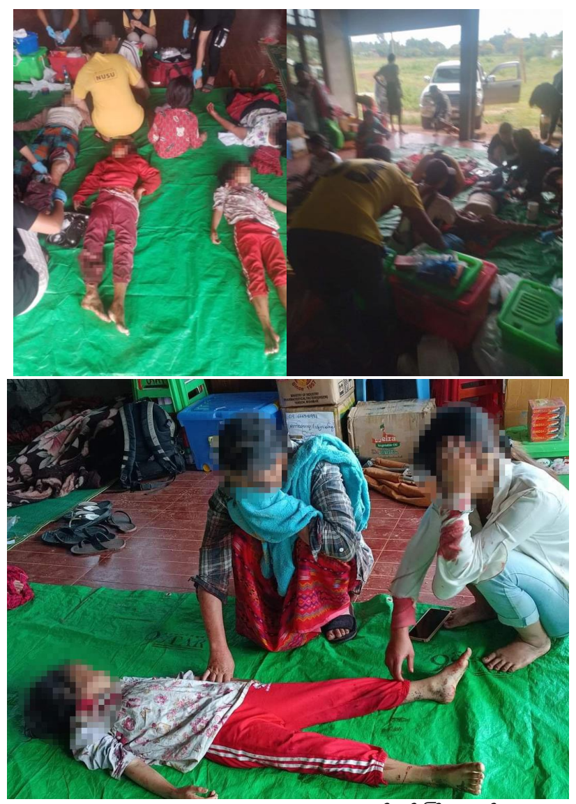
Figure 35: The casualties from the attack on Mwedaw Pagoda (မွေတော်ဘုန်းကြီးကျောင်း) in a medical facility.

An image of the deceased girls, timestamped at 0742, shows their bodies bandaged at the funeral location (figure 36). Their bodies were still on stretchers which could potentially indicate their recent arrival. The body of another person covered by a blanket is seen on the left side of the image. An additional image, timestamped at 0827, shows the deceased girls inside body bags. Two deceased adults are shown covered by body bags, likely to be the two adults that were also killed in the shelling of the pagoda.