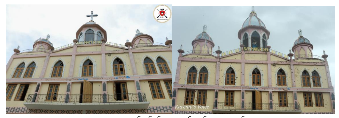
Figure 13: Mary Mother of God church (ဘုရား၏သန့်ရှင်းသော မယ်တော်ဘုရားကျောင်း) in Moebye in July 2022 (left) and September 2022 (right) showing potential bullet holes and shrapnel on its exterior.

On 9 September 2022, the second day of the fighting, KNDF reported that SAC troops were occupying Mary Mother of God church in Moe Bye. This is not the first time that SAC troops occupied this church; in July 2022, MBPDF announced that SAC troops occupied it for two days. The July announcement provided multiple images from the town, including images of the church and adjacent buildings. This information has allowed investigators to compare the destruction of the church in July, to September. In July, potential bullet holes and broken windows were seen in the image of the church front (figure 13, left). Following the SAC's retreat from the church on 12 September, images and additional footage posted to social media, the church front seemed drastically more damaged than in July. The facade has more bullet holes and broken windows (figure 13, right).