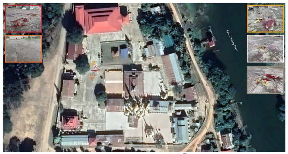
Figure 32: Geolocation of blood stains in Mwedaw Pagoda (မွေတော်ဘုန်းကြီးကျောင်း) (Sources: Top left: <u>The Voice of Karenni</u>; bottom left: <u>Kayan Generation Youth</u>; top right, middle and bottom right images sources redacted for privacy concerns).

A report posted by <u>SHRF</u> claimed that Moebye town was shelled from both the north and the east during September. Analysis of the footage, conducted by Myanmar Witness, ruled out the possibility that the shelling was carried out from the north due to a lack of evidence showing damage to the north side of the pagoda and strengthened the assessment that the shells were fired from the east due to the appearance of damage to the eastern walls. The SAC's 362 artillery battalion is based 14 kilometres east from the pagoda and could be responsible for the shelling.