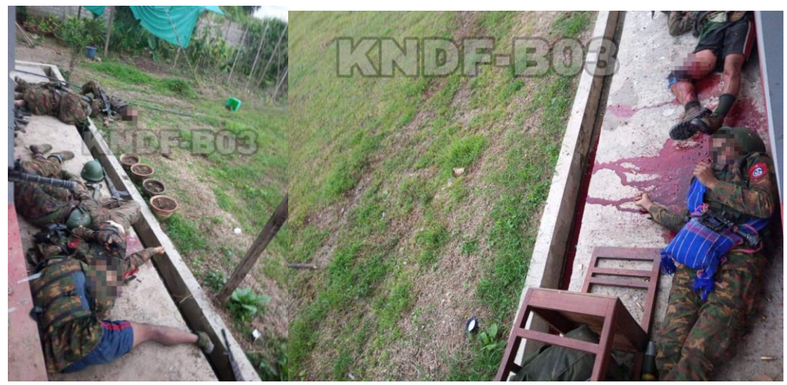
Figure 17: Corpses of SAC troops, claimed to be in Moe Bye (မိုးမြိမြို့), posted on 11 September 2022.

On 11 September 2022, images of deceased SAC troops were posted by the <a href="KNDF-B03">KNDF-B03</a> (figure 17). Despite the difficulties to precisely geolocate the images, <a href="multiple sources">multiple sources</a> of UGC, uploaded in September 2022, led Myanmar Witness to the conclusion that the images are likely to be from Moe Bye. A possible location of the images is by a building in the Mary Mother of God church perimeter [19.741219, 97.091990] (figure 18).