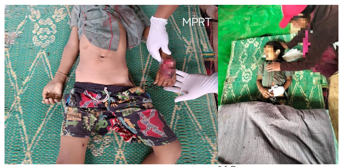
Figure 6: Examination of the child who was allegedly killed in Moe Bye (မိုးမြှုံ) and a relative mourning of his death, posted on 9 September 2022.

The child was seen undergoing medical examination but eventually he was pronounced dead. The open wound on his left hand was bandaged, as seen in footage showing his mourning mother.