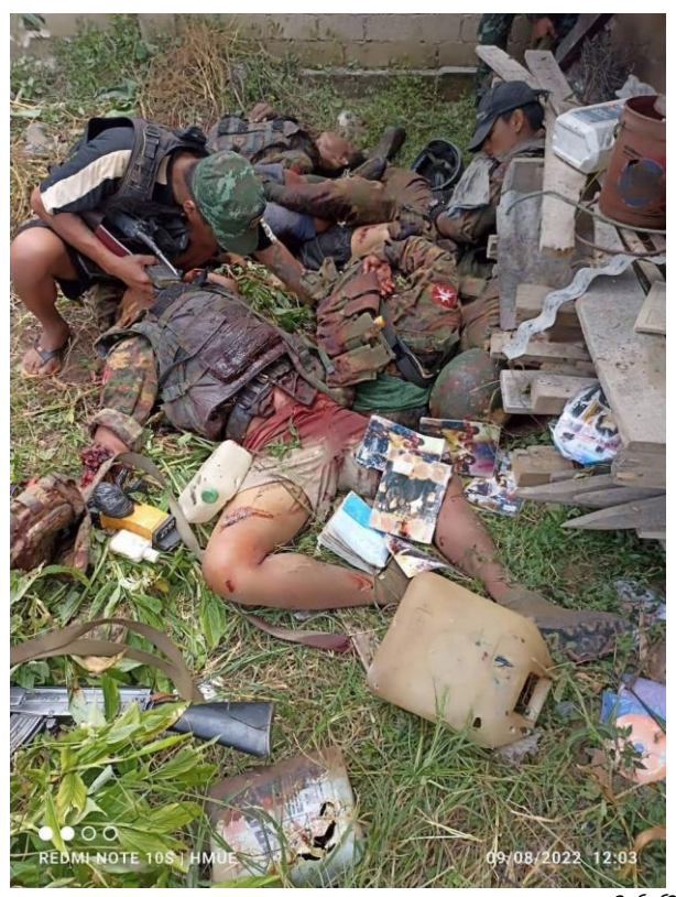
Figure 3: The bodies of SAC troops who were allegedly killed during Moe Bye's (မိုးမြို့) battle on 8 September 2022 (Source: Khit Thit Media).