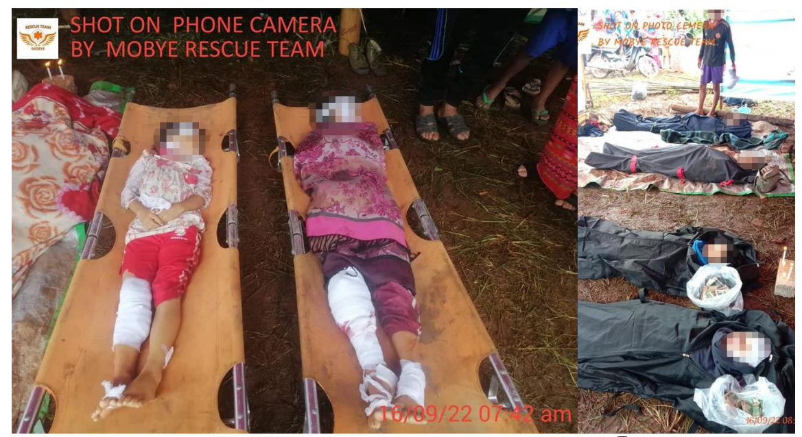
Flgure 36: Timestamped images of the corpses from Mwedaw Pagoda (မွေတော်ဘုန်းကြီးကျောင်း) in the unknown funeral location, posted on 16 September 2022.