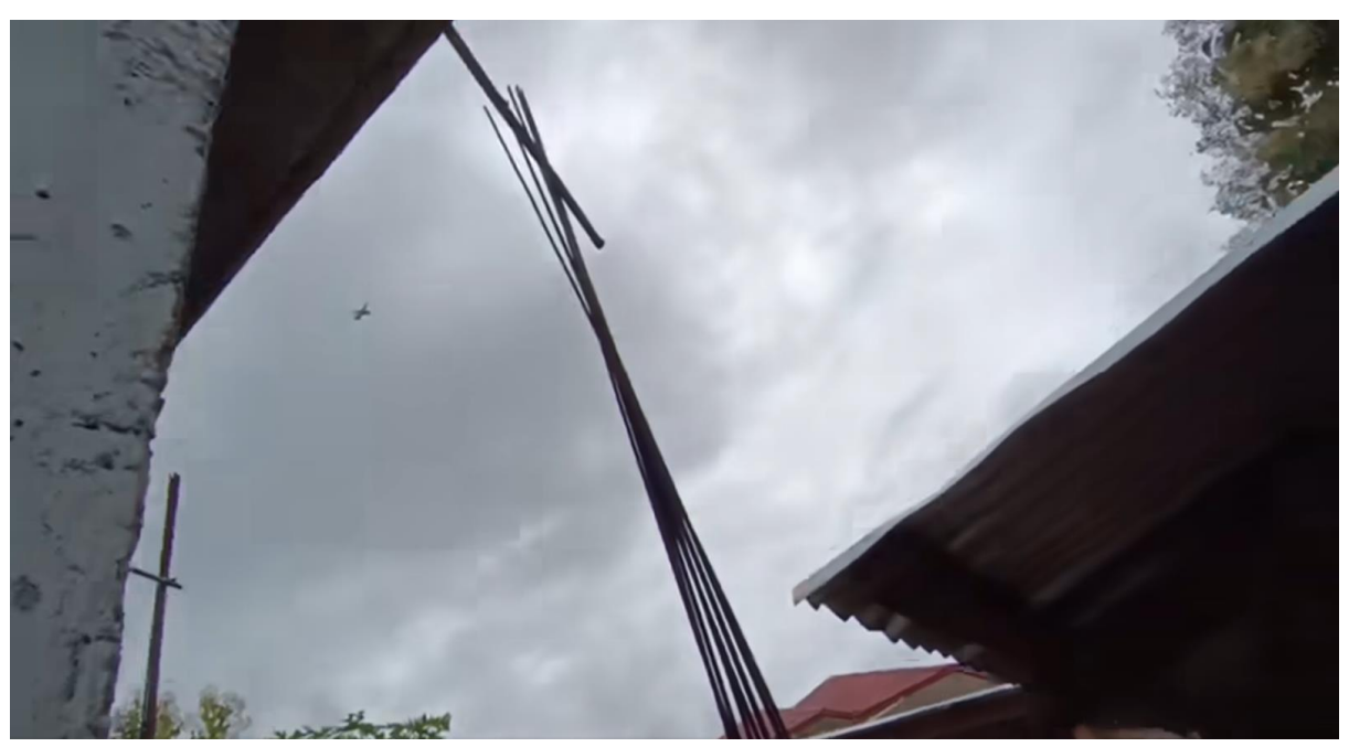
Figure 37: SAC K-8 fighter jet in Moebye.

Myanmar Witness was able to geolocate several of the videos to Moe Bye using distinctive features visible in the surrounding area, including roofs, advertisements and power lines. For the safety of those creating and sharing this content online, these have been omitted from the report as they revealed the individuals filming the videos, or were taken within property boundaries.