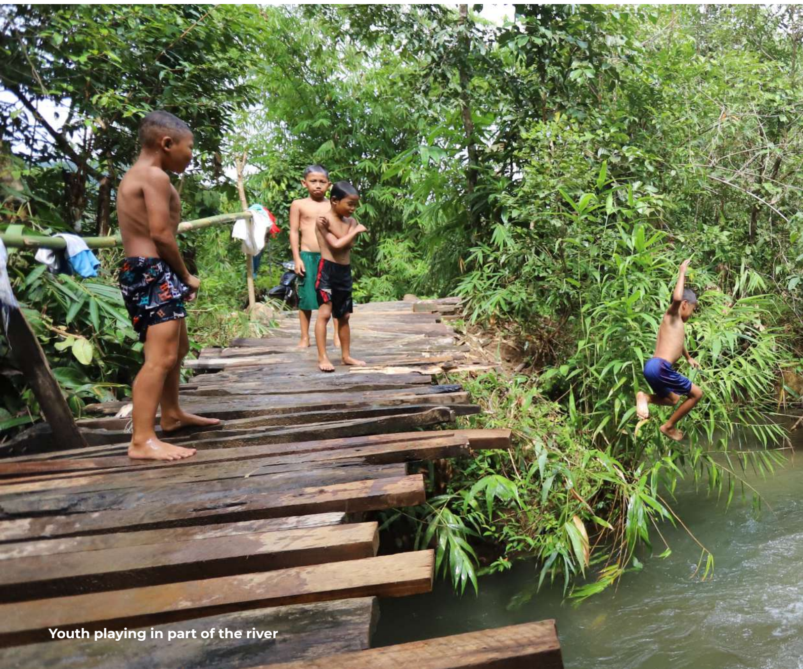
Youth playing in part of the river

referendum, officially making Myanmar a multi-party democratic state. 28 This constitution is still in force today, and divides the country into seven administrative states, seven regions and one union territory. 29 These are further subdivided into townships, urban wards and village tracts. 30