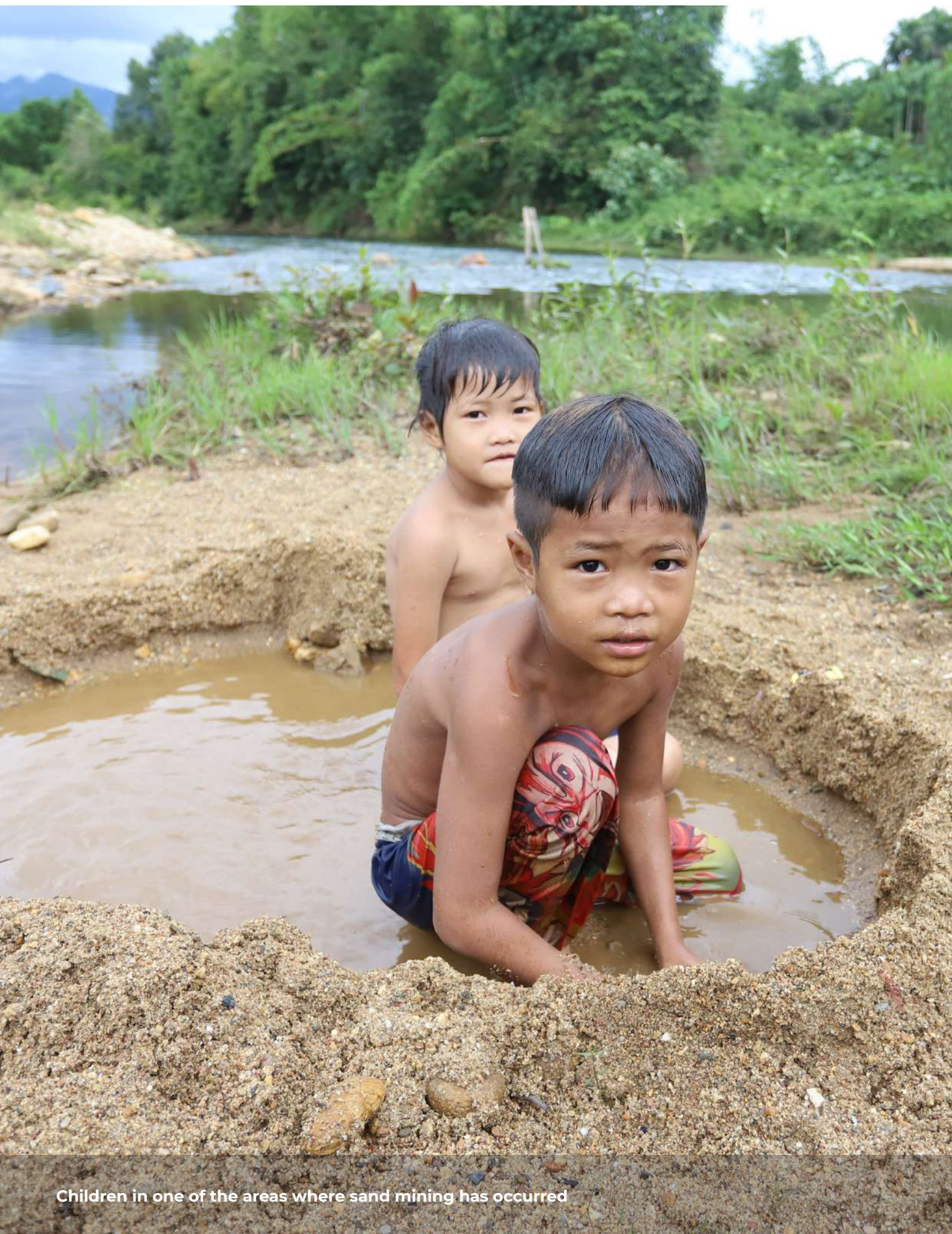
Children in one of the areas where sand mining has occurred