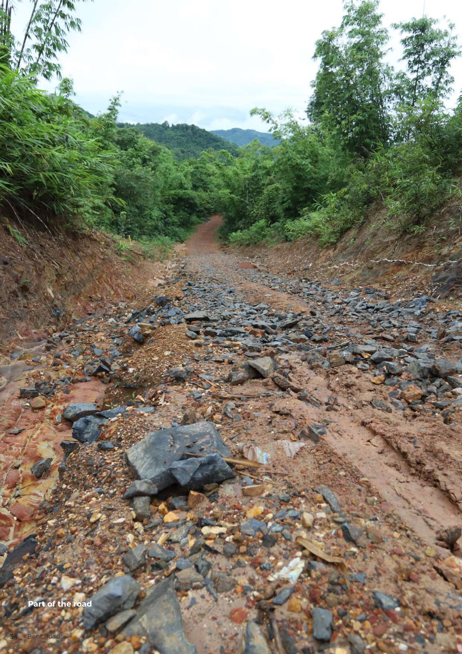
Part of the road