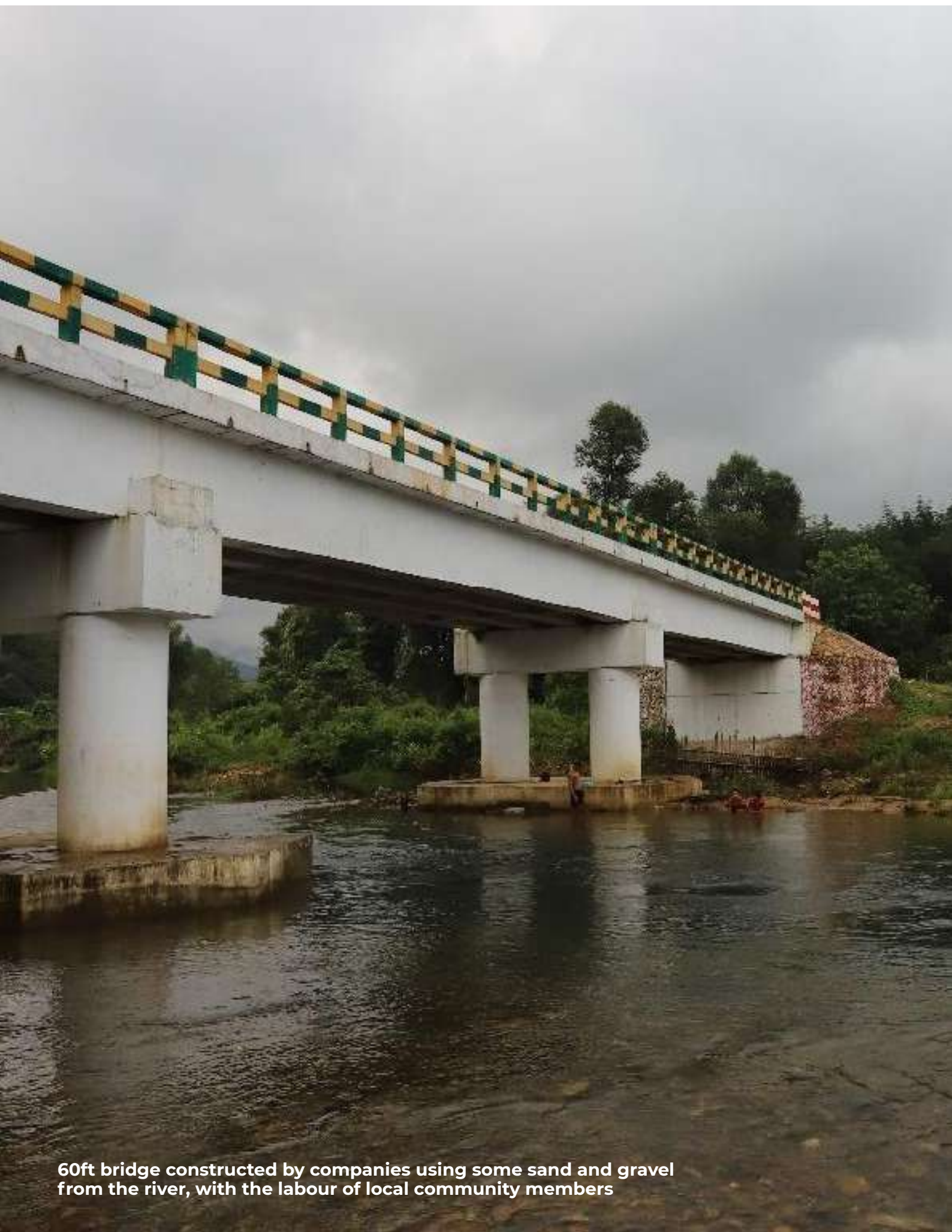
60ft bridge constructed by companies using some sand and gravel from the river, with the labour of local community members