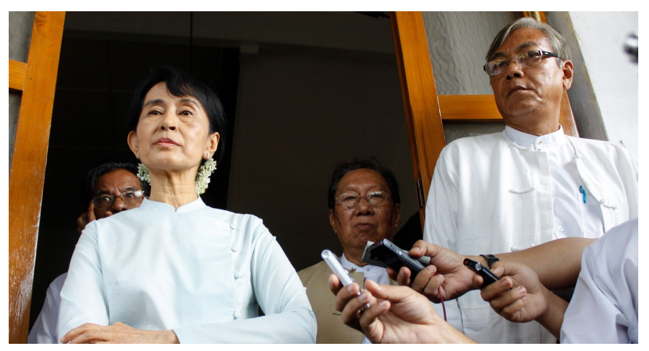
Photo: A picture made available on 10 March 2016 shows Htin Kyaw (R), standing next to Aung San Suu Kyi during a press meeting at her residence in Yangon, Myanmar

In 2003, the SPDC announced its seven-step road-map to what it described as a "discipline-flourishing democracy", which included the drafting of a new Constitution, elections and then ceding power to a new civilian government. The Constitution, in which the pro-democracy forces had no say in drafting, was eventually approved in 2008, in a referendum widely condemned as a sham that took place days after Cyclone Nargis devastated wide areas of the Myanmar Delta, killing at least 130,000 people.<sup>22</sup>