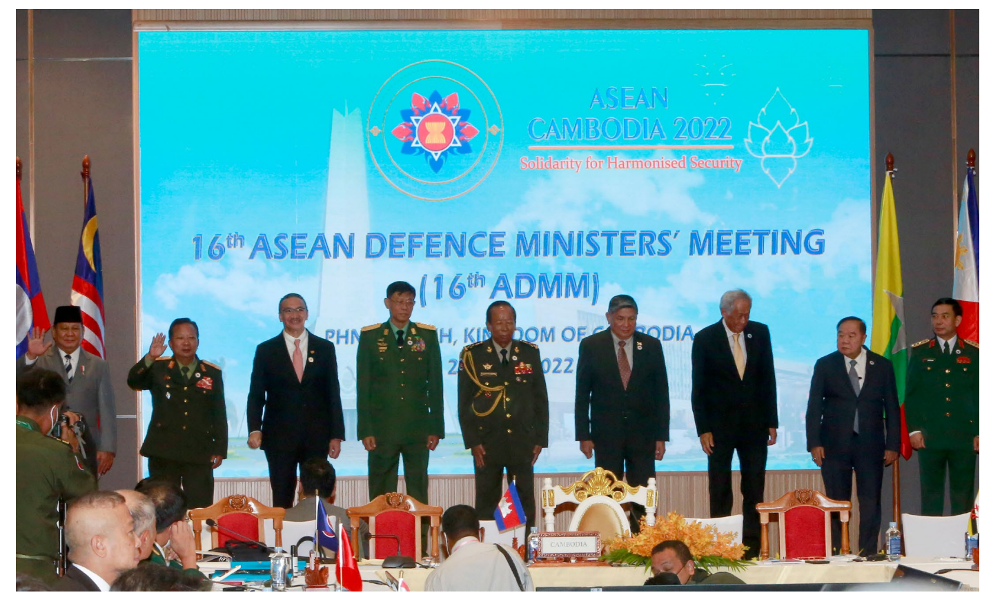
Photo: The 16th ASEAN Defence Ministers' Meeting in Cambodia © EPA-EFE.