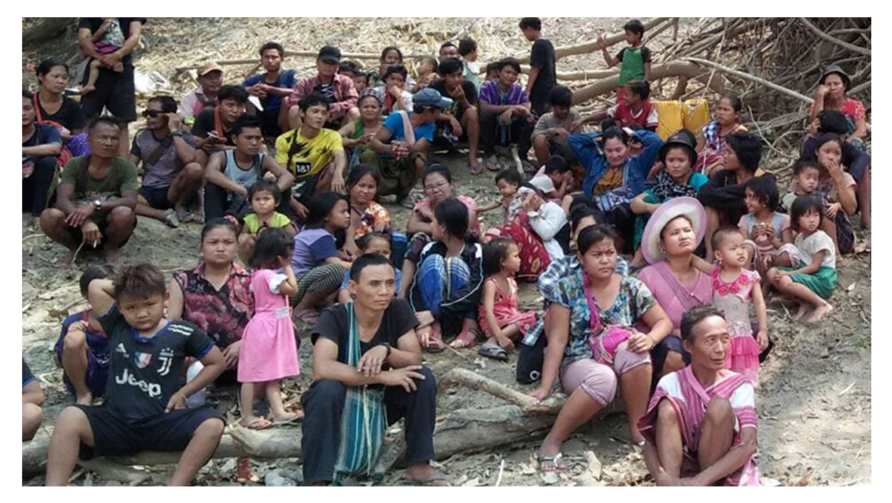
Photo: Ethnic Karen villagers fleeing from air attacks by Myanmar military take rest in a jungle after crossing border at a Thai-Myanmar border in Mae Hong Son province, Thailand, 28 March 2021 © EPA-EFE