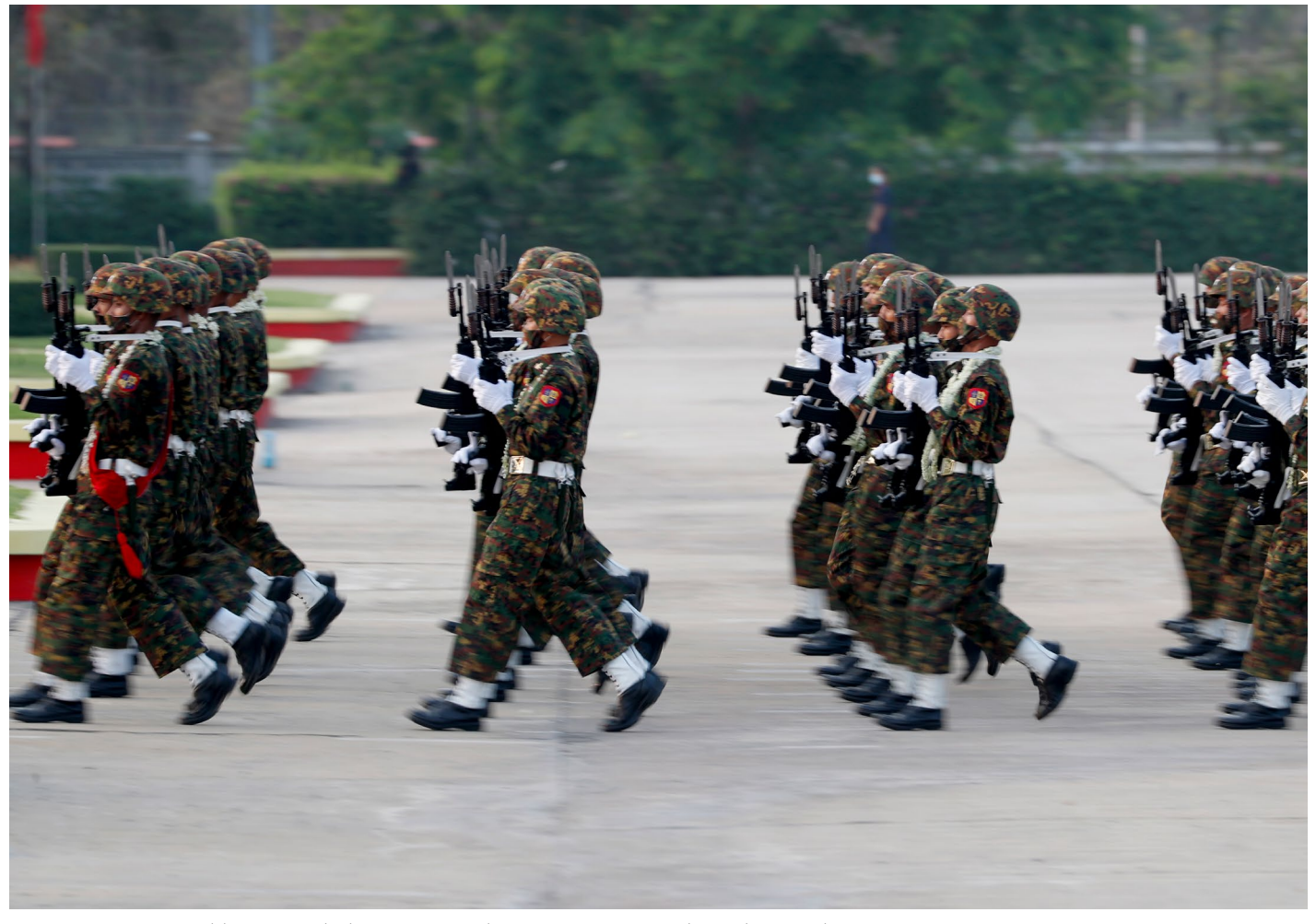
Photo: Myanmar soldiers march during a parade commemorating the 77th Armed Forces Day in Naypyitaw, Myanmar, 27 March 2022.