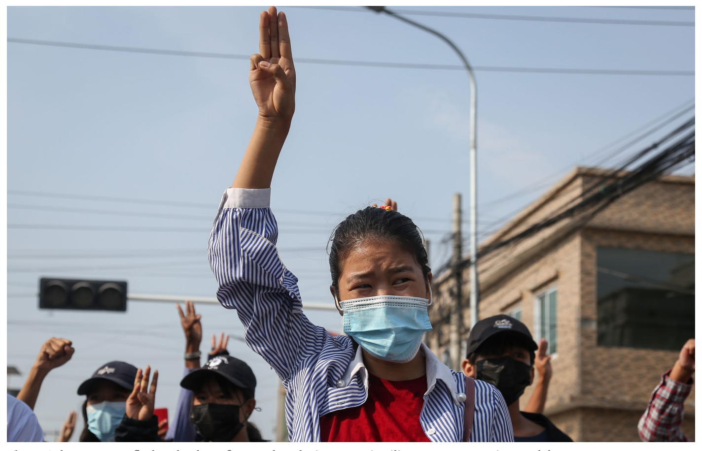
Photo: A demonstrator flashes the three-finger salute during an anti-military coup protest in Mandalay, Myanmar, 18 May 2021. © EPA-EFE