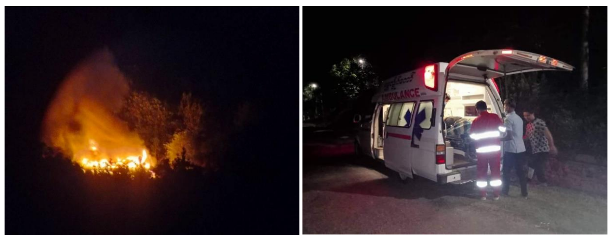
House torched by SAC, Nan Paw Lo village

On June 25, from 6 am to 2;30 pm there were heavy clashes between combined forces of KA, KNDF, Loikaw PDF, DMO PDF, KRU, Middle Special Force and SAC troops based in Daw Nga Kar quarter, Kone Thar village and Thay Hsu Leh village, Demawso town. During the fighting, 3 soldiers from the resistance forces suffered minor injuries. SAC casualties are unknown.