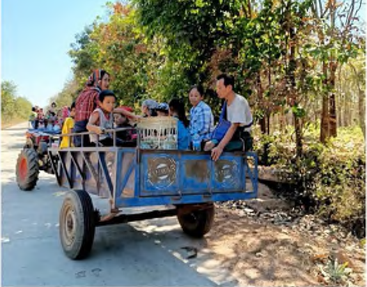
IDPs from U Kray Hta village fleeing fighting, Waw Lay area, south of Myawaddy, Dooplaya District, June 26, 2022