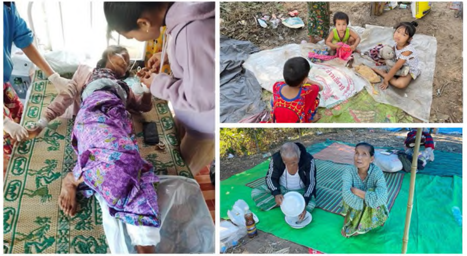
IDPs at Plaw Ter Pyo IDP site, Pa Lu Poe, south of Myawaddy, Dooplaya District.

KPSN also urges Thailand to give protection and shelter to refugees fleeing Burma Army attacks and persecution, and to allow humanitarian agencies to access and assist these refugees.