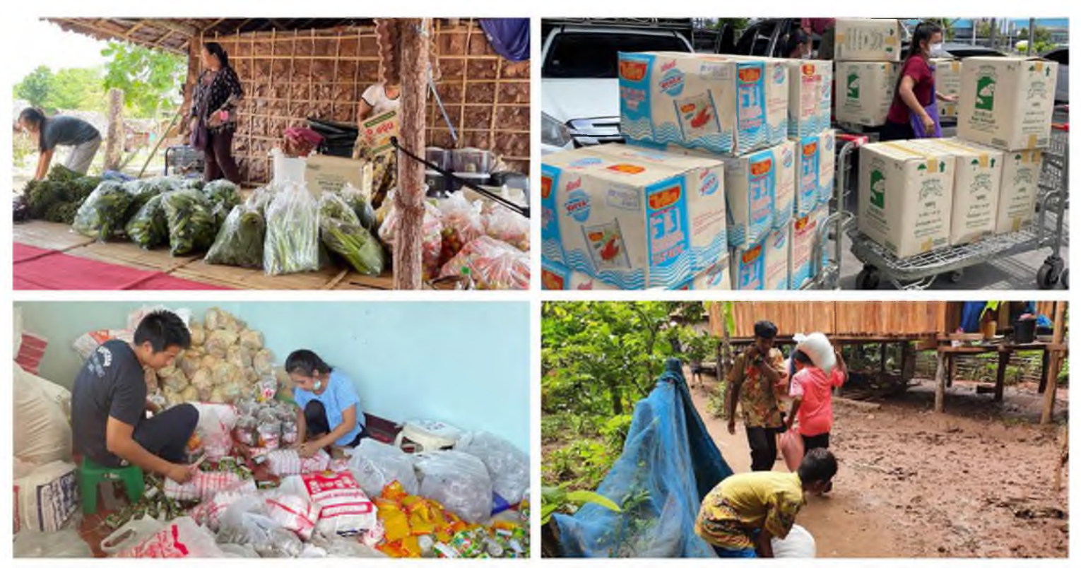
KERT/KCBOs responding to emergency needs of IDPs fleeing airstrikes, heavy shelling by Burma Army in U Kray Hta and Ler Khaw, Dooplaya District