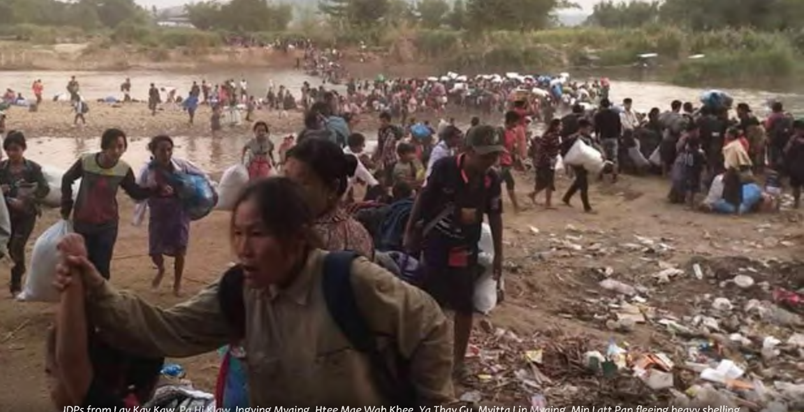
IDPs from Lay Kay Kaw, Pa Hi Klaw, Ingying Myaing, Htee Mae Wah Khee, Ya Thay Gu, Myitta Lin Myaing, Min Latt Pan fleeing heavy shelling and fighting to Thai side of border, Dec 19, 2021