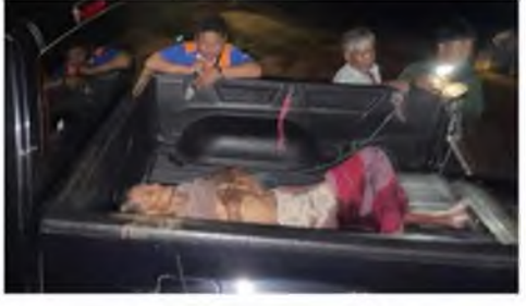
Villager injured by SAC airstrike in Thay Baw Boe, July 1, 2022