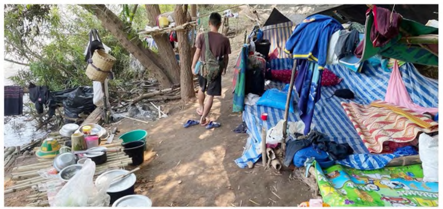
IDP site on riverbank at Thay Baw Boe village, south of Myawaddy, Dooplaya District, January 2022

The SAC troops have looted and destroyed villagers' possessions, burned down houses, and forced villagers to be porters and human shields. On March 20, they seized the KNU's Dawna Hospital, about 10 kilometers south of Kawkareik town, and looted the contents before retreating. Local health workers still dare not return.