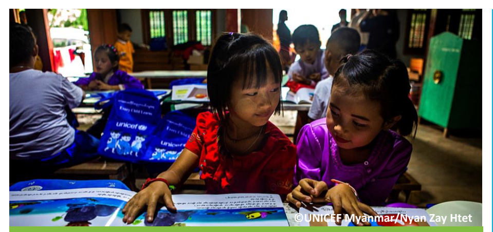
Reporting Period: 1 to 30 June 2022