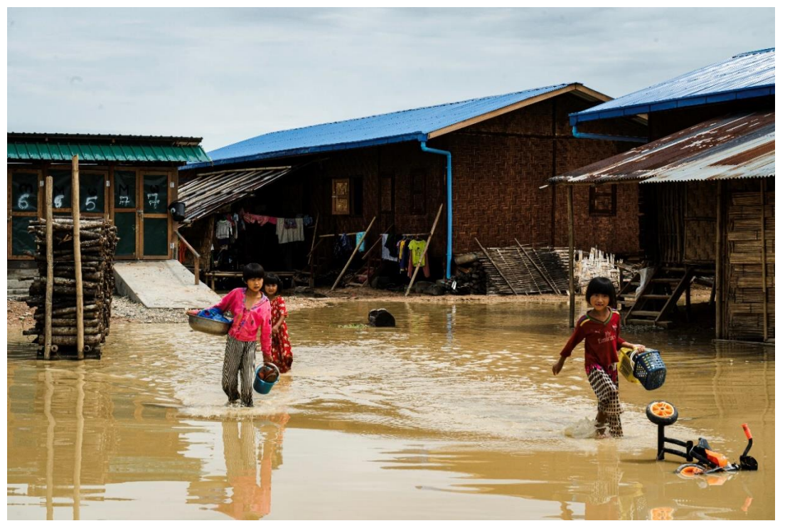
Flooding in Khar Shay IDP camp, Myitkyina township, Kachin State, 18 May 2022

Since the beginning of the monsoon season, heavy winds and rains have continued and gradually increased the water level of the Ayeyarwady River, resulting in flooding in several townships across Kachin State. The flooding has submerged shelters, destroyed food stocks and vehicles, and triggered several landslides in the area. Furthermore, several hundreds of people were temporary evacuated.