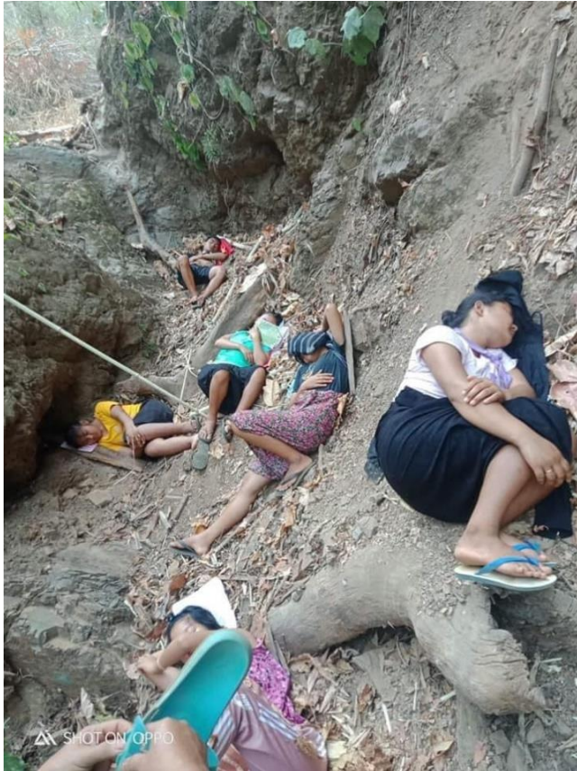
Figure 5 How IDPs sleep