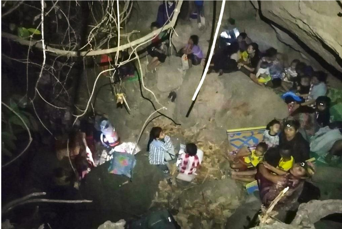
Figure 3 Residents from the Day Pu No village hiding in the jungle, north of Hpa-pun in eastern Myanmar's Karen state after the area was hit by air strikes late on March 27