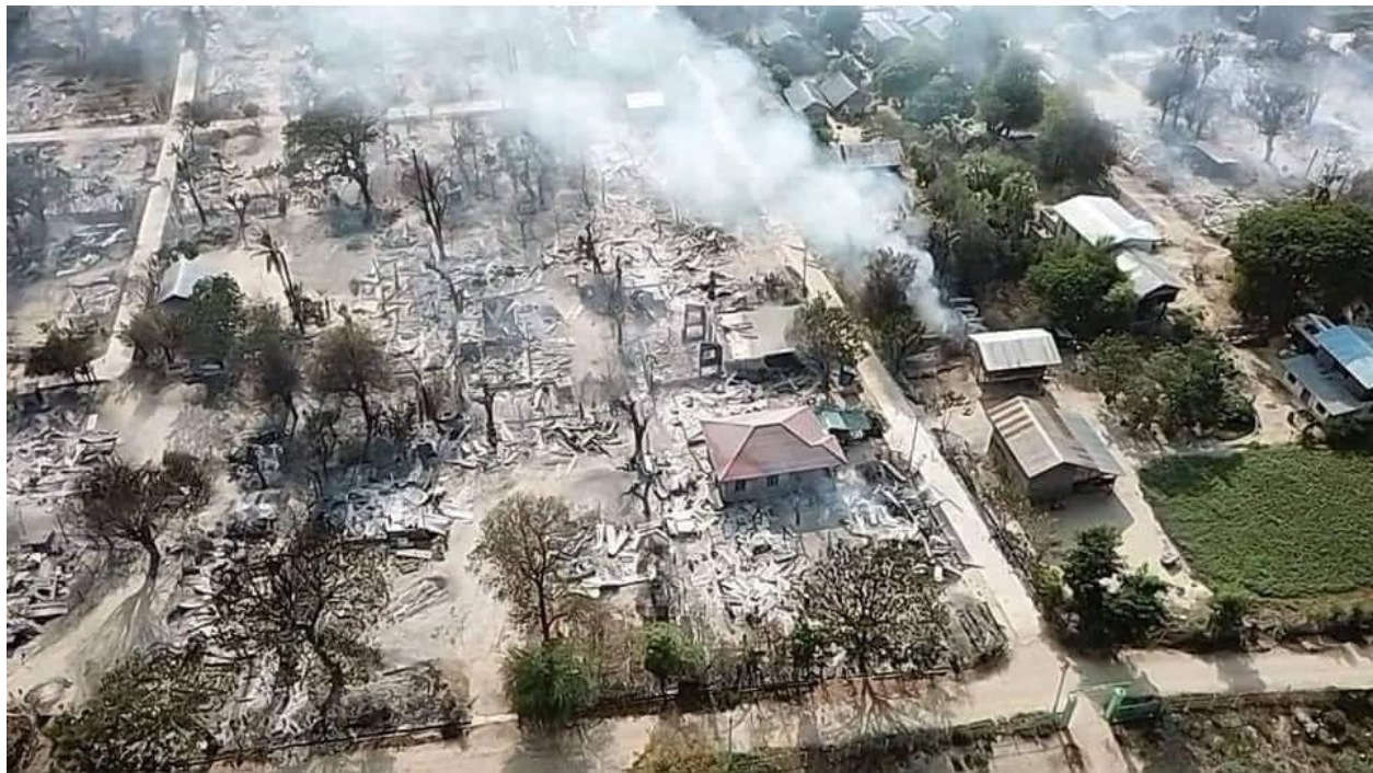
Figure 2 A village in central Burma called Inn Ma in the Chaung Oo Township which was burned to the ground by the Burmese military on April 24, 2022. People's lives are being destroyed with impunity just because they dare to think about freedom. Cutting off aircraft fuel is important so that air strikes will stop.