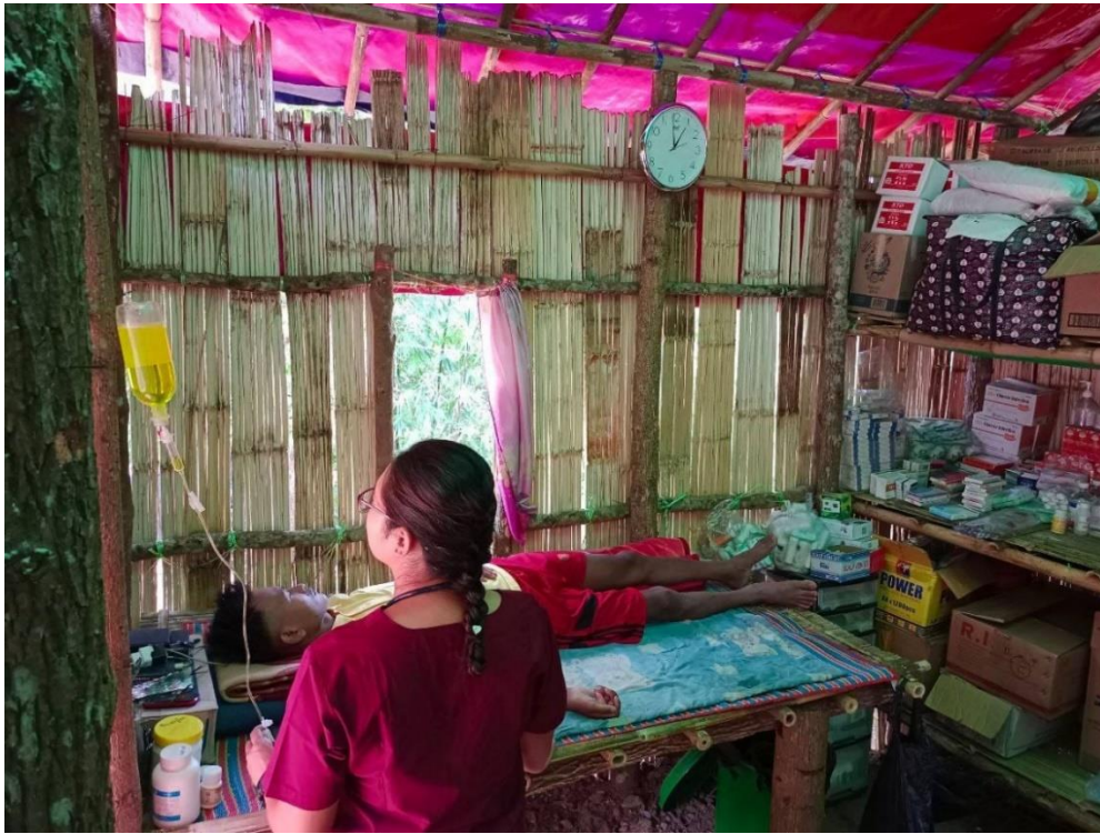
Figure 7 A jungle medical clinic