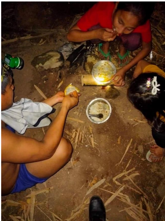
Figure 8 How IDPs eat