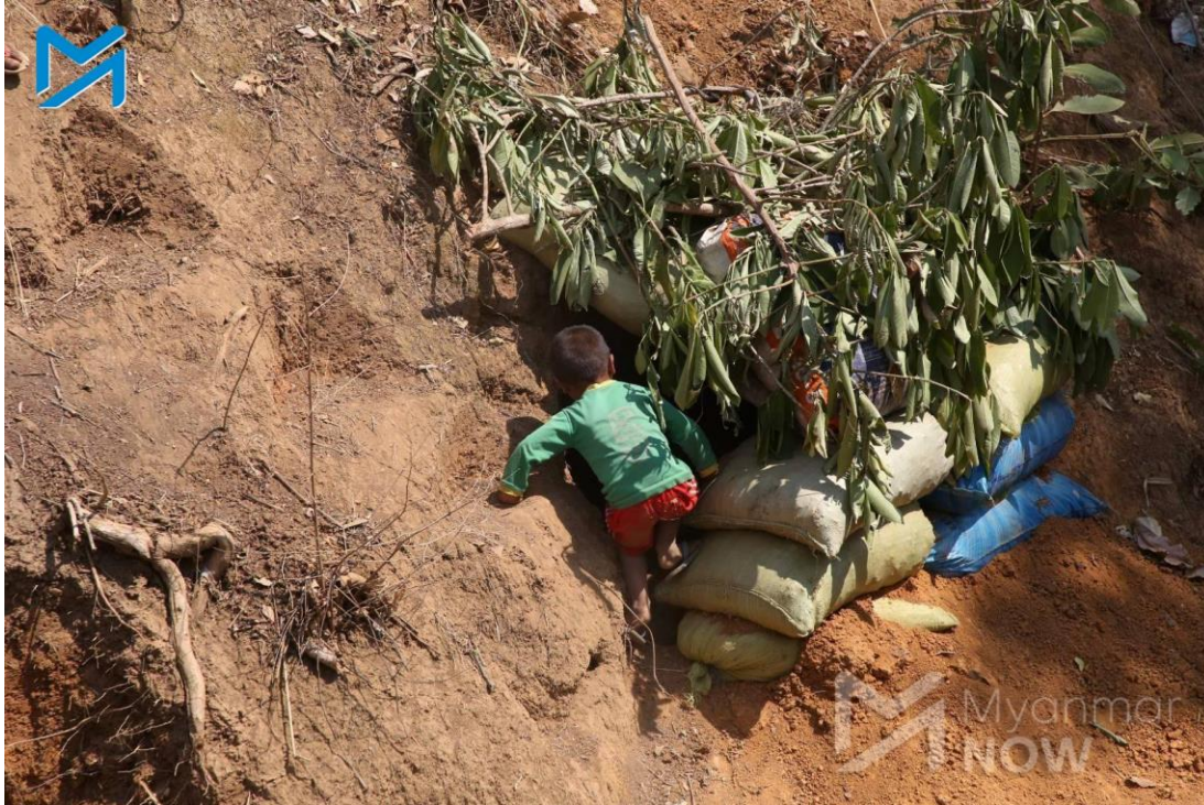
Figure 13 Children entering a bomb shelter. Cutting off aircraft fuel is important so that air strikes will stop.