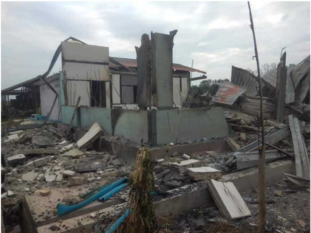
Figure 10 Aftermath of a bombing. Cutting off aircraft fuel is important so that air strikes will stop.