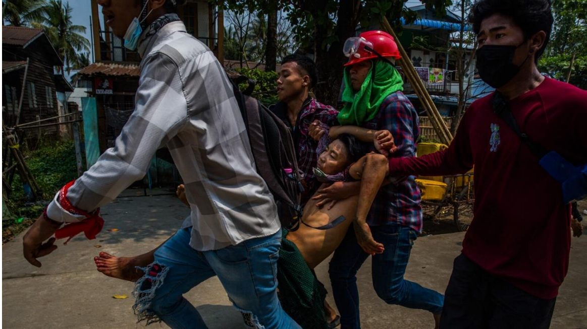
Figure 17 A shot protester being carried to safety. Please see AAPP | Assistance Association for Political Prisoners (aappb.org) for the latest statistics.