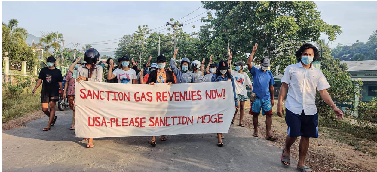
Figure 1 Burmese youth -Southern Burma - risking their lives just to rally – driven by their strong belief that the U.S. could help. Please don't let them down. https://www.business-standard.com/article/international/myanmar-public-urges-gas-sanctions-to-stop-military-funding-amid-violence-121121500361_1.html