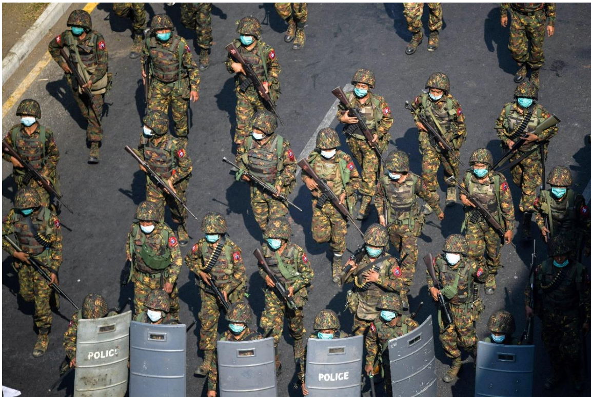
Figure 18 The military in full combat gear marching towards the protesters