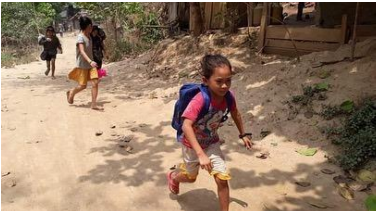
Figure 12 Children fleeing an air strike. Cutting off aircraft fuel is important so that air strikes will stop.