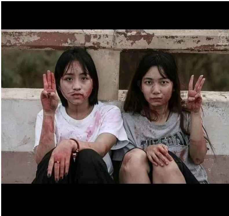
Figure 14 Arrested young women still defiant. Please see AAPP | Assistance Association for Political Prisoners (aappb.org) for the latest statistics.