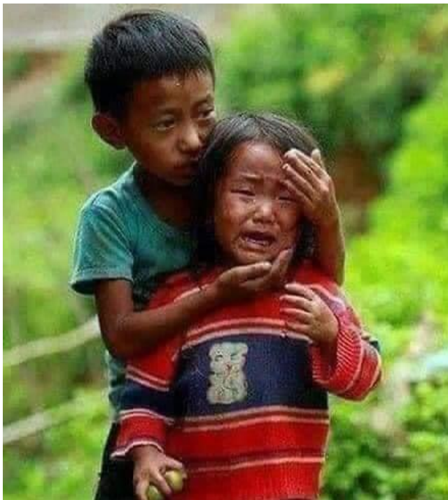
Figure 6 An IDP child comforting his sister