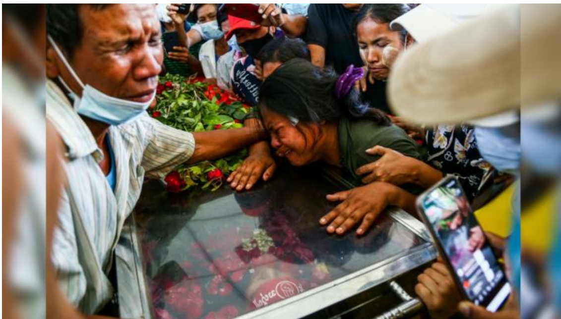
Figure 16 Grieving family of a slain protester. Hundreds have been tortured and killed. This family was lucky to get the body back for proper burial. Please see AAPP | Assistance Association for Political Prisoners (aappb.org) for the latest statistics.