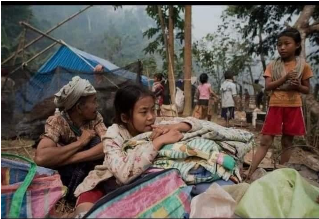
Figure 4 Inside an IDP Camp