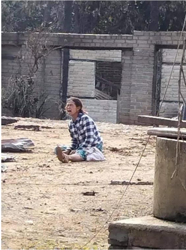
Figure 11 A woman grieving the loss of her home. Cutting off aircraft fuel is important so that air strikes will stop.