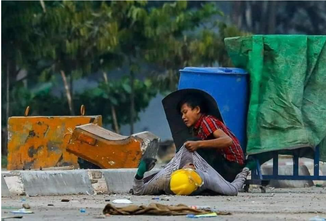
Figure 15 A protester grieving his shot friend. Please see AAPP | Assistance Association for Political Prisoners (aappb.org) for the latest statistics.