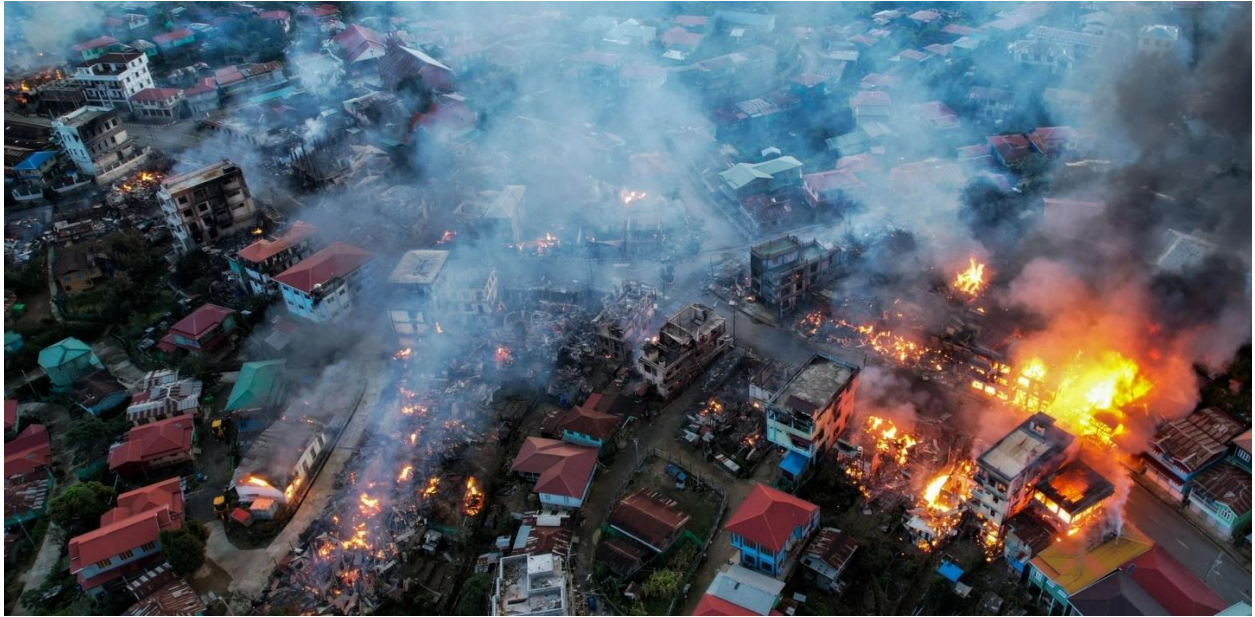
Figure 9 A bombed city in Chin land. Cutting off aircraft fuel is important so that air strikes will stop.