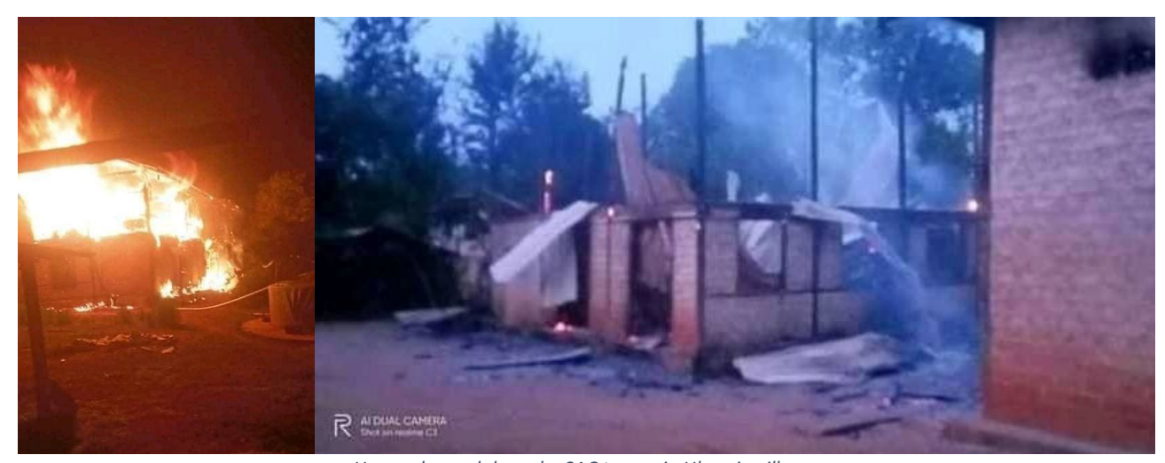
Houses burned down by SAC troops in Hlwasin village

On April 13, 2022, at about 1 am, about 20 SAC troops came in a truck and burned down two houses belonging to U Ni and U Si in Hlwasin village, Nankhong tract.