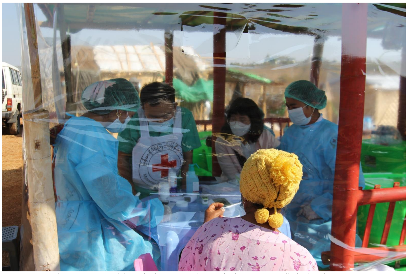
A Myanmar Red Cross Society Mobile Medical Team providing medical care in internally displaced persons' (IDP) camps in Taunggyi, Shan state, 1 March 2022.