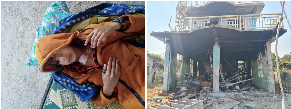
A young girl injured by SAC shelling

On February 17, heavy clashes occurred throughout the day in Moebye town, and at Haik Kwi dam and near Hwarisuplair village. Two SAC bren-carriers were damaged and 20 SAC soldiers were killed, while seven Moebye PDF soldiers were killed and six were injured. While heavy clashes occurred in Moebye town, the SAC used artillery, tanks and 2 jet fighters to bomb the town with seven airstrikes. Due to indiscriminate shelling by the SAC, two women and five men were injured, and one of them died. Moreover, five houses were burned and damaged. All the residents of Hwarisuplair village, where heavy clashes took place, fled from the clashes.