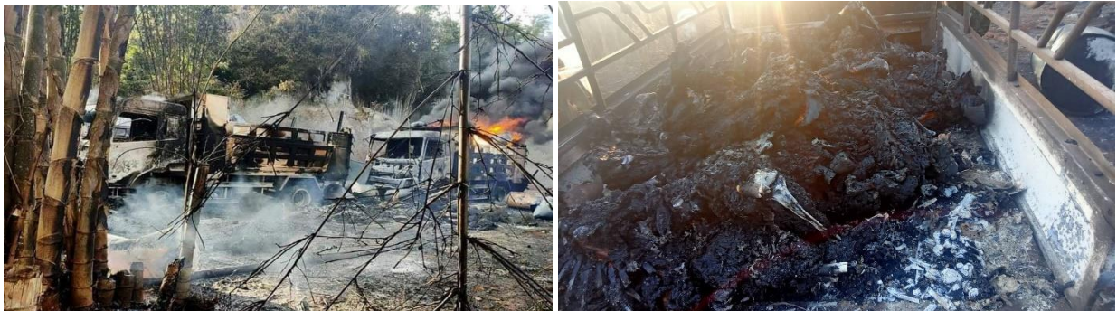
The charred vehicles and remains of civilians massacred by SAC near Mo Hso village, Pruso township