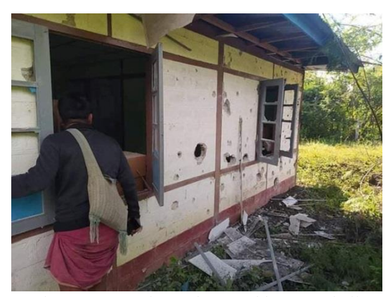
Shwe Pyi Aye clinic, damaged by SAC shells

On November 1, combined KA and KNDF troops clashed with SAC troops camped at Htu Lwi Belar village, Demawso township, killing 8 SAC soldiers. One KNDF soldier was injured.