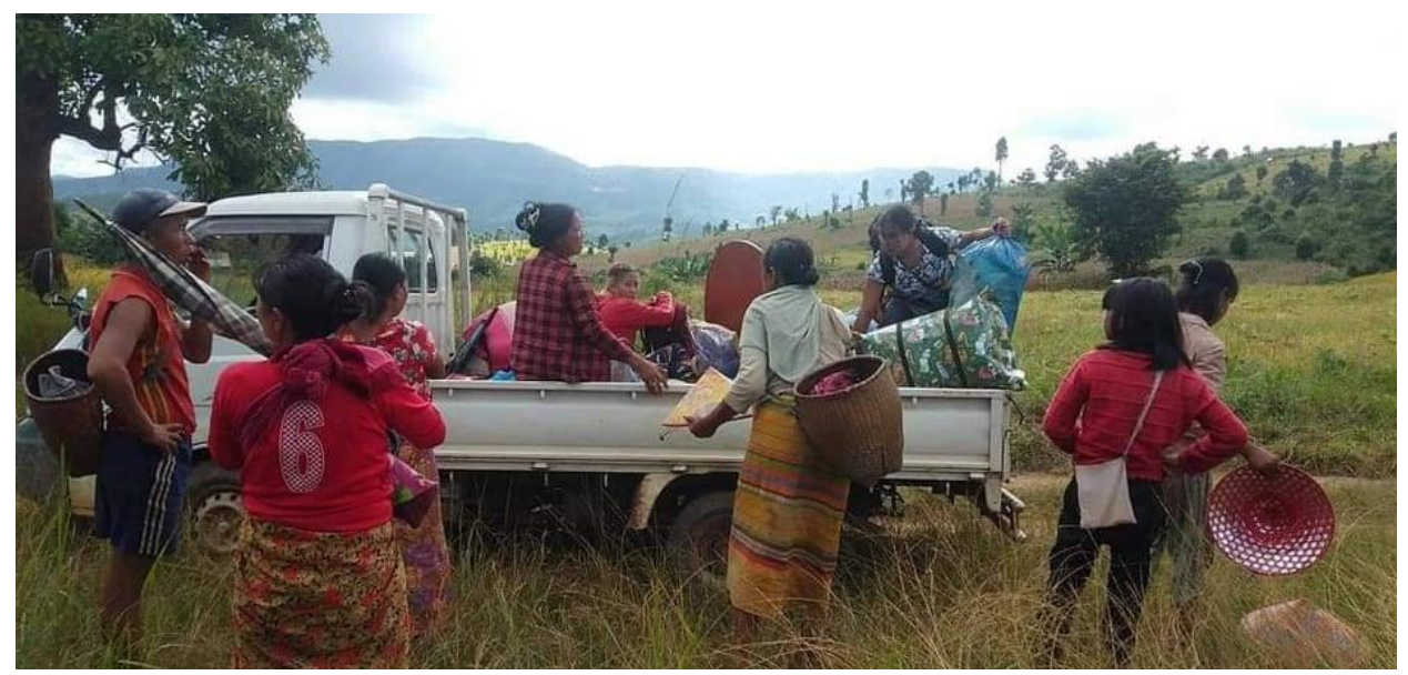
Villagers fleeing from SAC clearance operations while harvesting in western Pekhon

On November 2, at 2 pm, the KA, KNDF, Pekhon PDF and Moe Bye PDF clashed with SAC troops while they were carrying out clearance operations in western Pekhon township. Five SAC soldiers were killed and 2 PDF soldiers injured. These clearance operations, being carried out by about 500 SAC soldiers, caused the villagers of Loi Lon and Loi Hweh villages, who were in the middle of harvesting their rice fields, to flee to nearby jungle.