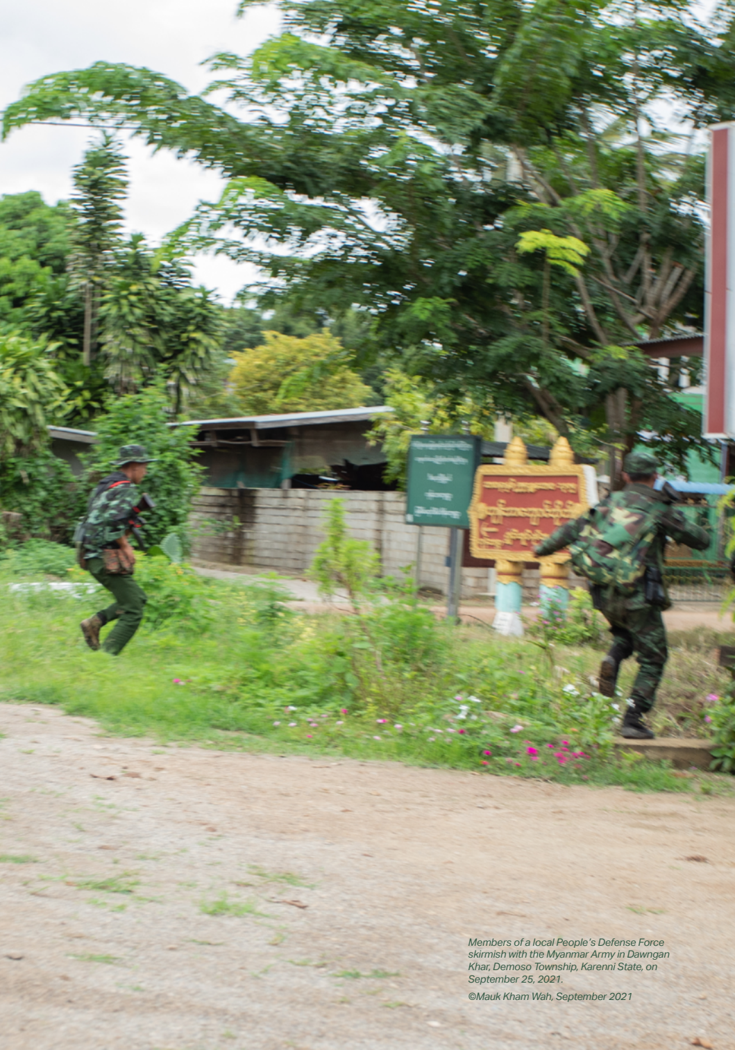
Members of a local People's Defense Force skirmish with the Myanmar Army in Dawngan Khar, Demoso Township, Karenni State, on September 25, 2021.