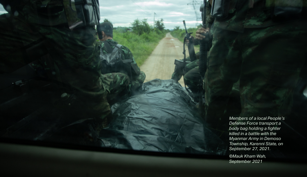
Members of a local People's Defense Force transport a body bag holding a fighter killed in a battle with the Myanmar Army in Demoso Township, Karenni State, on September 27, 2021.