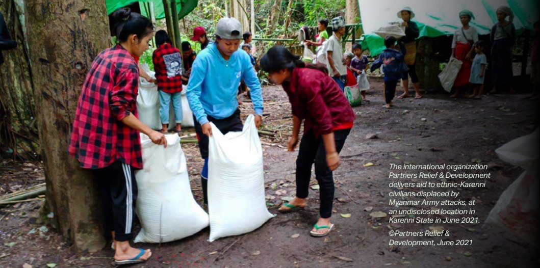
The international organization Partners Relief & Development delivers aid to ethnic-Karenni civilians displaced by Myanmar Army attacks, at an undisclosed location in Karenni State in June 2021.