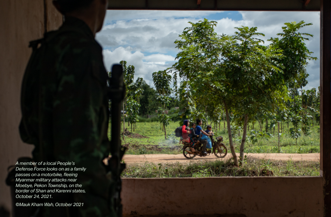
A member of a local People's Defense Force looks on as a family passes on a motorbike, fleeing Myanmar military attacks near Moebye, Pekon Township, on the border of Shan and Karenni states, October 24, 2021.