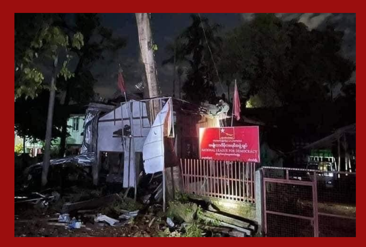
Bomb Attack in Belin Town, Sayasan Ward at the NLD Headquarters

In fact, the junta is also targeting National League for Democracy MP's, officials, and supporters. The NLD Party which won the largest number of votes in the November 2020 election. In October, at least 10 NLD offices were attacked. The junta has also broken into NLD offices, looting items, committing arson and setting off bombs. At least 25 properties owned by Hluttaw representatives, NLD members, and ordinary civilians such as hotels, hospitals, houses and shops, were illegally seized by the junta in October.