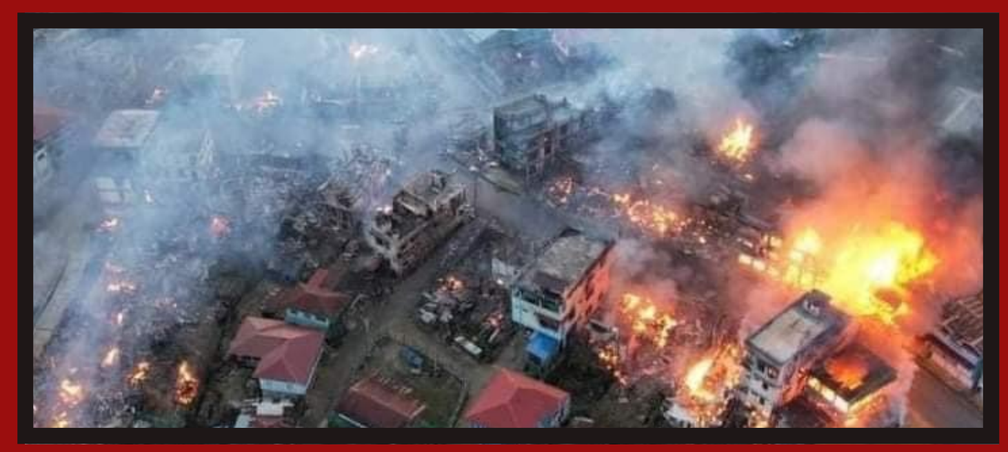
Thantlang Town, Chin State After Being Destroyed by the Junta