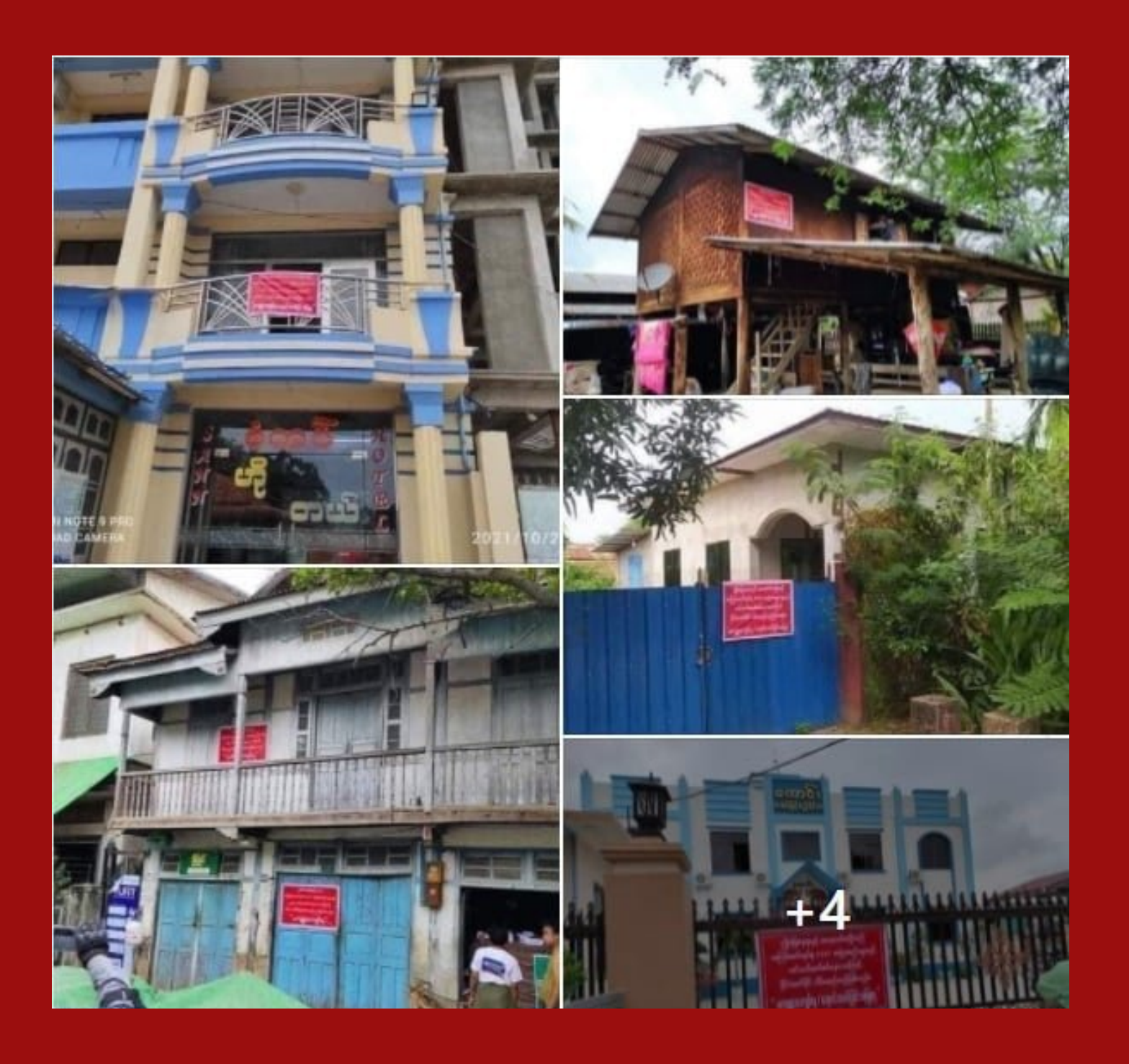
Properties Taken by the Junta