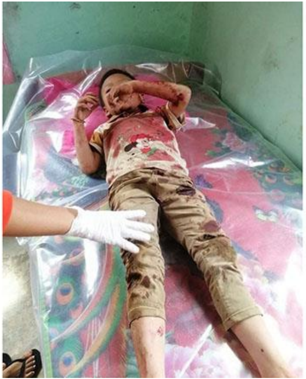
Children were injured by SAC shelling, Pekhon Township