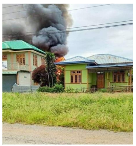
Houses set on fire by SAC in Demawso

On October 14, SAC torched two houses in Daw Khlent Li village in Demawso township. On the same day, SAC troops carrying out clearance operations in 6-Mile village, Bethle village and Walatwan village in Demawso were targeted by mines laid by KNDF, which killed three SAC troops and injured four. SAC and KNPP troops also clashed between Nam Ku village and Pan Pu village in Pasaung township.