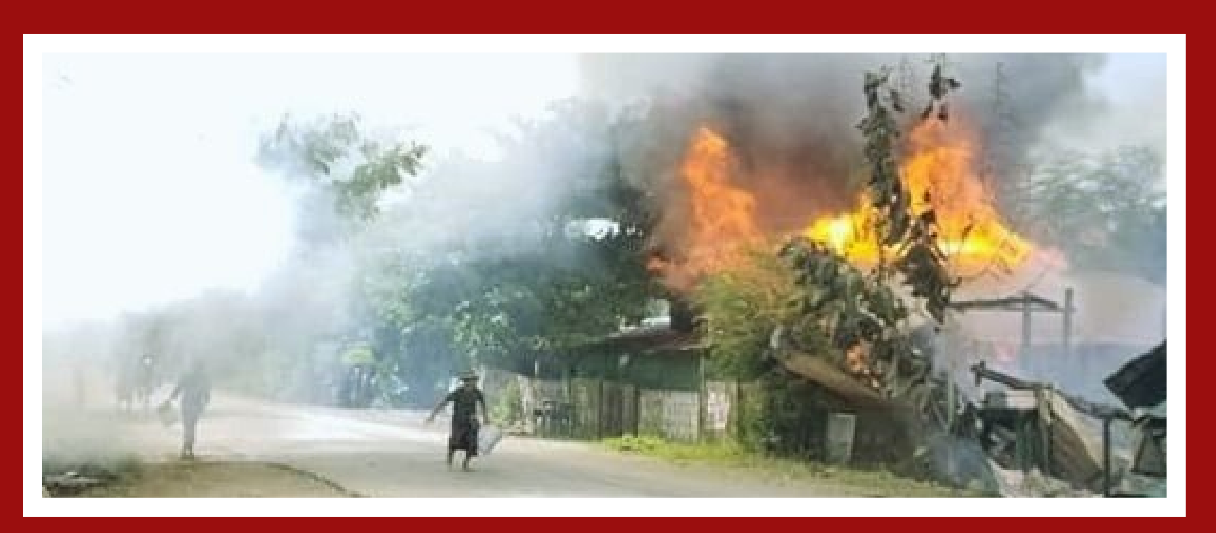
Hnan Khar Village, Gangaw Township, Magway Region

In addition, the statement said that if the house/apartment owner does not report a registration list, and the tenants are found to have committed "acts of violence", that apartment will be taken as state ownership, under the anti-terrorism law, and the property owner charged under the existing law.