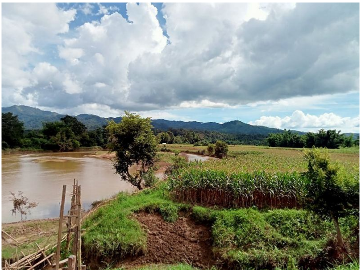
miand along the Pang River threatened by new coal min

sign, whatever they were offered. They said they relied on their farmlands for their livelihoods and no amount of money could provide for them throughout their lives like their lands.