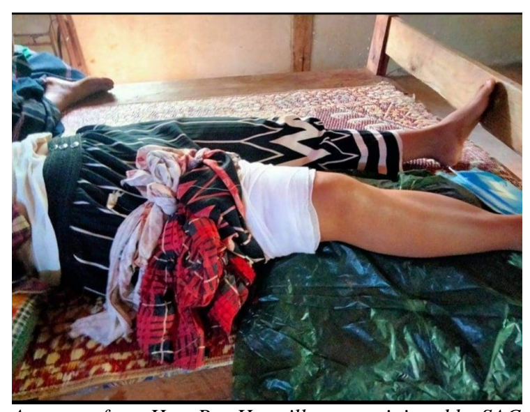
A woman from Htee Por Hso village was injured by SAC shelling.

On August 12, SAC troops clashed with KNPP/KNDF troops near Htee Klu Daw village in Pruso township. Five SAC soldiers were killed and three were injured. During this clash, KNDF reported that they seized some small guns and one mortar from the SAC. After this, on the same day, SAC troops started deploying more soldiers in and around Pruso town. A clash took place near Kadah Lah village, close to Pruso town, between SAC and KNPP/KNDF troops. LIB 102 and LIB 531 based in Demawso township launched artillery shells to support their troops in Pruso township, injuring a woman from Htee Por Hso village in Pruso township in her thigh, and a male villager in his arm from Nyow Khone village, Demawso Township.