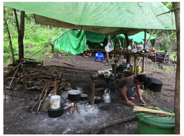
An IDP camp school