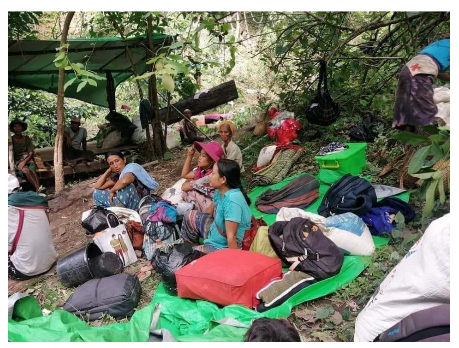
New IDPs in Nan Peh village tract.

hide in the surrounding jungle. The SAC troops also entered Nan Peh village and broke windows and front doors of villagers' houses