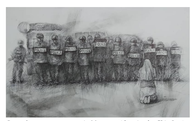
Scene from recent protests in Myanmar (drawing by Chin Lay)

Events related military's seizure of power in Myanmar have had significant impact on the work of the Mechanism and the unprecedented influx information it has received. Since 1 February 2021, the Mechanism has received over 210,000 information items, including videos, photographs and documents.