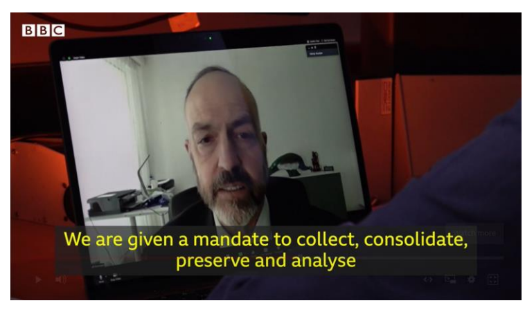
Screenshot from BBC News interview