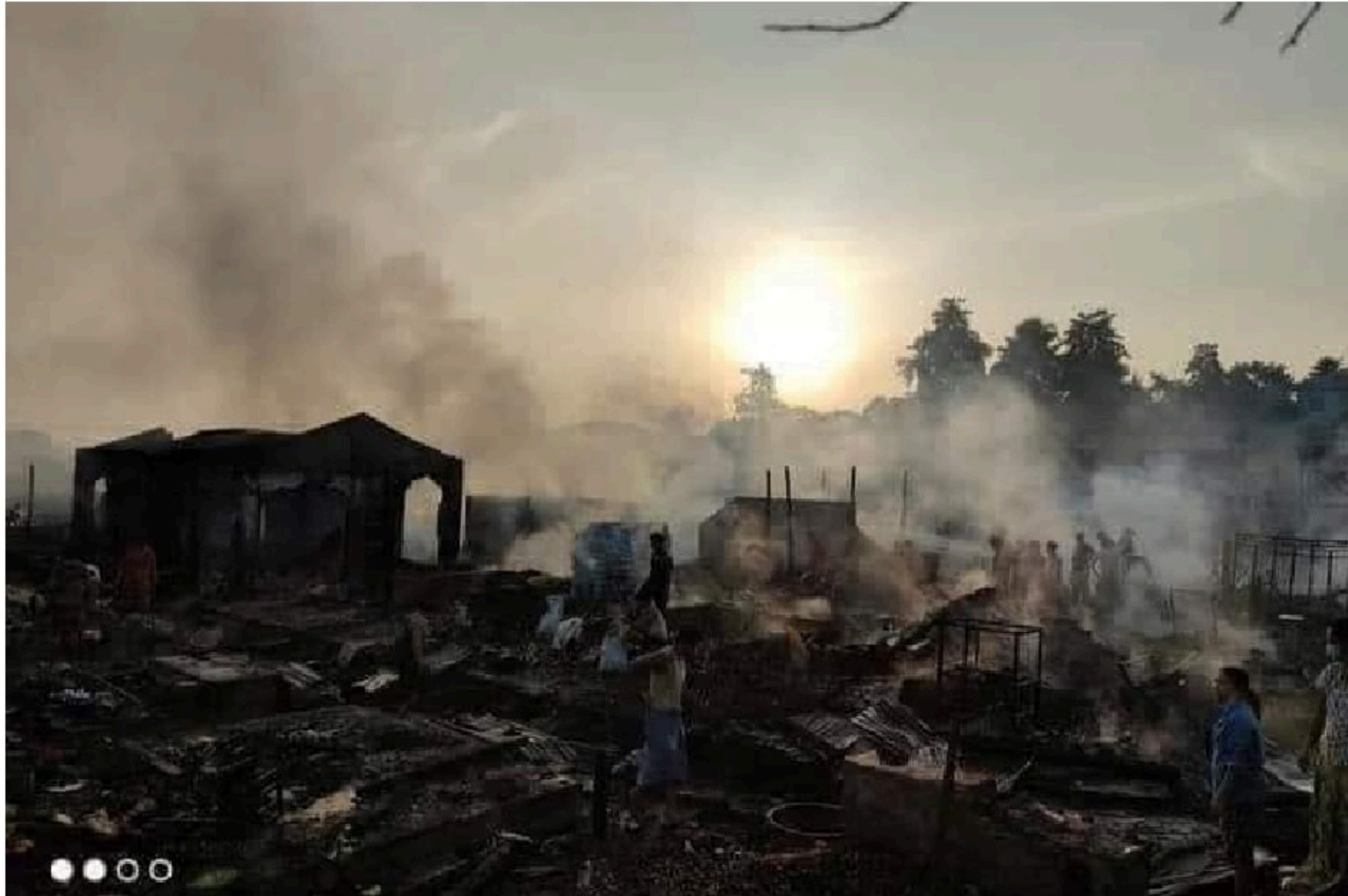
Destruction after heavy shelling and burning by SAC in Demawso

In fact, it is the SAC which has destroyed the roads and bridges, used people as human shields, and destroyed public buildings. It is the KPDF which is protecting their villages' security. Even though SAC suggested that people should find safe shelter, there is no safe place for anyone in the conflict areas. Even when people hid or sheltered in churches and retirement homes, the SAC shot at and broke into these buildings and attacked civilians hiding there. It can clearly be seen that there is no safe place for people in Karenni State.