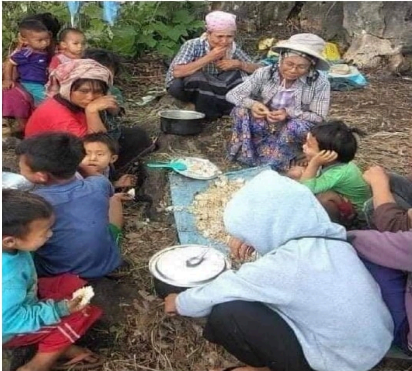
Karenni IDPs in Demawso township

According to data collected by KSCN, since mid-May, about 100,000 people have been displaced in Karenni State and in Pekhon township of Shan State. The current population of Karenni State is about 300,000 1 , and the population of Pekhon is about 100,000 2 . Therefore, about one fourth of the population of these areas has become internally displaced.