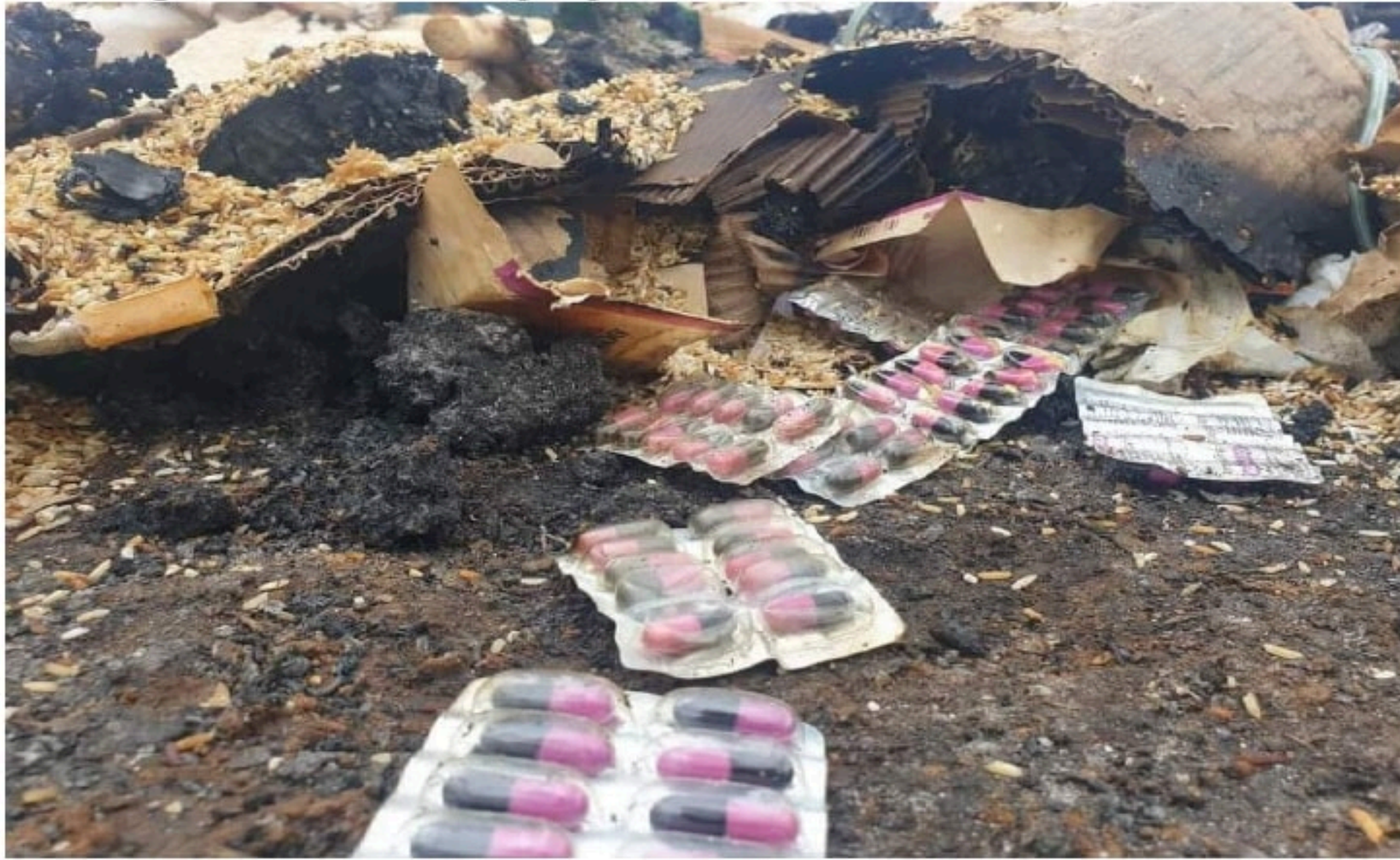
SAC burning of IDP rations and medicine on 12/6/2021 near Pekhoh town

This large-scale military build-up by the SAC military terrorists, their deliberate attacks on civilians and IDPs, and destruction of humanitarian aid for the IDPs, show clearly their genocidal intent against the Karenni people.