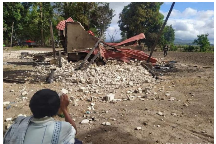
Home destroyed after Burmese military fired heavy artillery on Yayyo village in Loikaw Township, Karenni State on May 24.

Teachers have been targeted recently by the junta in Rakhine State. Teachers were ordered back to work on May 3 , but many ignored the order and joined the Civil Disobedience Movement. Many university students and staff have refused to participate in classes and several student unions have pledged support to anti-junta activists. Unexploded ordnances persist in Rakhine State. Three people were injured by an explosion on May 7. The Burmese military previously promised Rakhine villagers that all unexploded mines would be cleared, however this initiative has been largely ineffective and resulted in 45 deaths and 91 injuries since December 2020. Further, Rakhine State's IDPs continue to suffer, with an estimated 100,000 individuals surviving in makeshift camps unsuited for the country's upcoming rainy season.