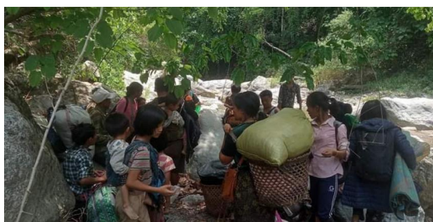
Civilians fleeing from the Burmese military occupation of Mindat.

This horrible situation comes on the heels of clashes between the military and the Chin Defense Forces (CDF). This organization only formed a month ago, on April 4, and has already seen some victories against the army. The CDF held onto Mindat for weeks despite bloody military assaults and even managed to secure the freedom of 20 of its soldiers from police custody. These early triumphs over the junta in Chin State have inspired ethnic people to take up arms. On May 5, the National Unity Government announced the creation of the People's Defence Forces (PDF) . Communities across Burma have begun forming their own PDF battalions.