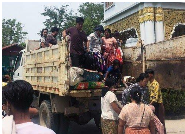
IDPs arriving to a Buddhist monastery in Bhamo district, Kachin state on May 18, 2021.

UNHCR estimates over 12,000 people have now fled Burma into neighboring countries since the start of the coup. The recent increase in fighting in Chin State has led to additional arrivals in neighboring Mizoram State, India, where local government officials are seeking solutions on how to meet the needs of the newly arrived refugees. The provision of medical care and food are of particular concern to the group as more refugees are expected if violence continues.