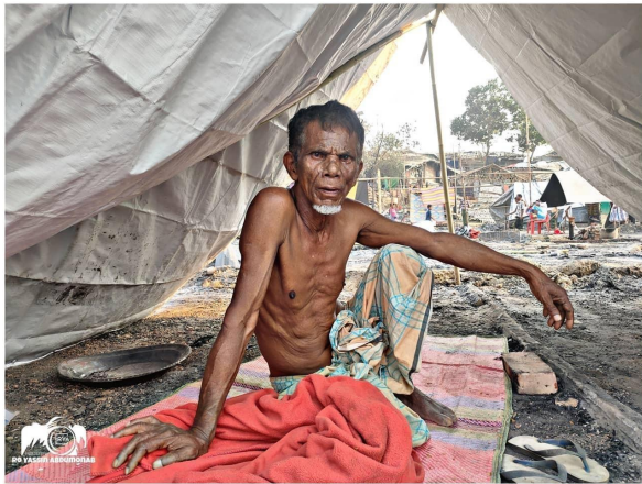
Elderly Rohingya man seeks shelter under a tarpaulin after a March 2021 fire destroyed parts of the Balukhali refugee camp in Cox's Bazar.

Instead, Yassin watched as the Tatmadaw stripped away every bit of happiness from the Rohingya people, his people. All valuable property was taken. Community mothers and sisters were raped. Others, not killed in indiscriminate shootings, were arbitrarily arrested and jailed.