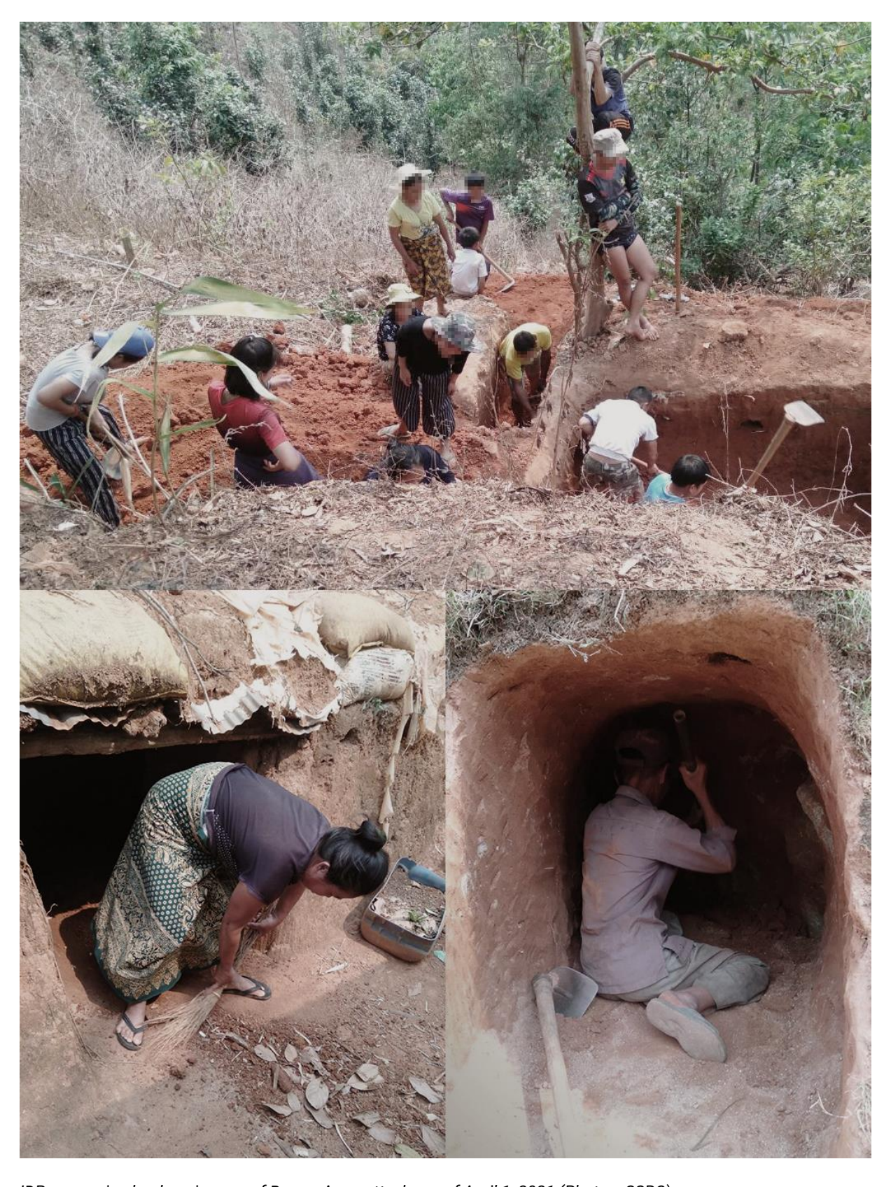
IDPs preparing bunkers in case of Burma Army attacks as of April 1, 2021