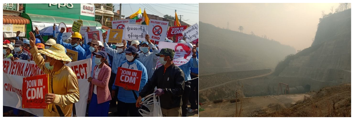
CDM protest in Kyaukme town on February 17, 2021

Since the military coup on February 1, anti-coup protests have taken place in towns near the Upper Yeywa dam site, including Kyaukme and Hsipaw. On February 17, workers from the Upper Yeywa dam site joined the protests in Kyaukme, holding a banner saying "Upper Yeywa Hydropower Project Civil Disobedience Movement." They were not seen joining any public protests after this date, but the sound of pot-banging in support of the CDM movement has been heard from the dam site in the evenings. Construction work at the dam site appears to have almost completely stopped.