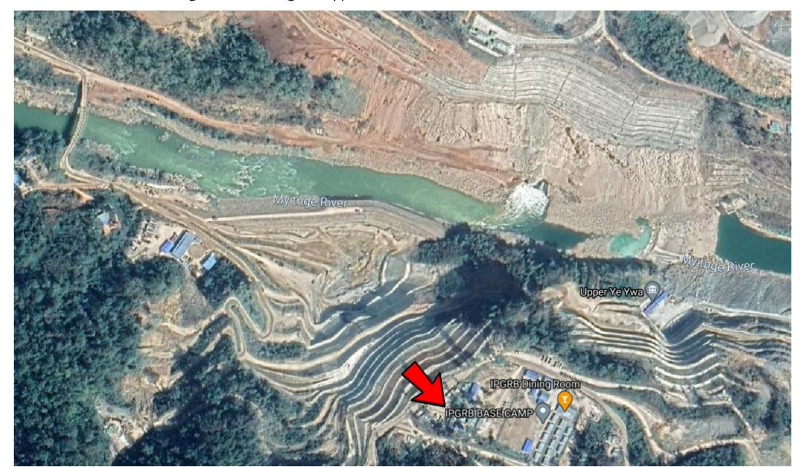
Google satellite image of Upper Yewa dam-site with "IPGRB BASE CAMP" label

IPGRB appears to be the main foreign company now on the ground at the Upper Yeywa dam-site. The current Google satellite image of the site labels it as "IPGRB BASE CAMP."