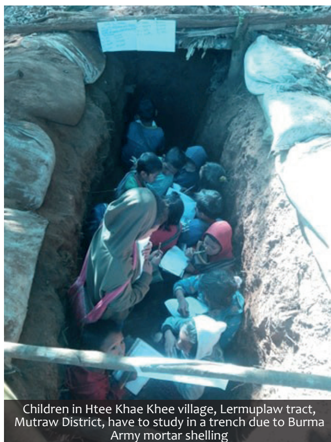
Children in Htee Khae Khee village, Lermuplaw tract, Mutraw District, have to study in a trench due to Burma Army mortar shelling