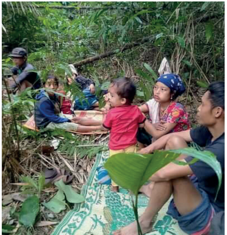
IDPs hiding from Burma Army in the jungle, Kler Lwee Htoo District