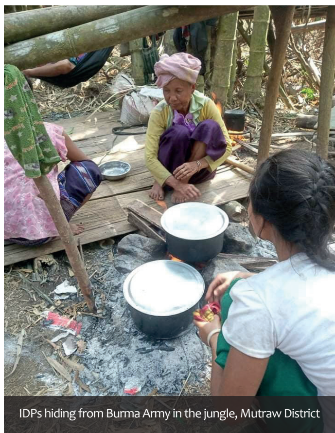
IDPs hiding from Burma Army in the jungle, Mutraw District

Currently, there are 69 Burma Army camps in Kler Lwee Htoo (Nyaunglinbin) District 4 and 83 Burma Army camps located in Mutraw District 5 where communities are trying to establish the Salween Peace Park. While the number of military camps in Kler Lwee Htoo District has not increased during the ceasefire period, the number of Burma Army troops stationed there has almost doubled. The situation is worse in Mutraw District where 12 new Burma Army bases have been established and troop numbers have substantially increased.