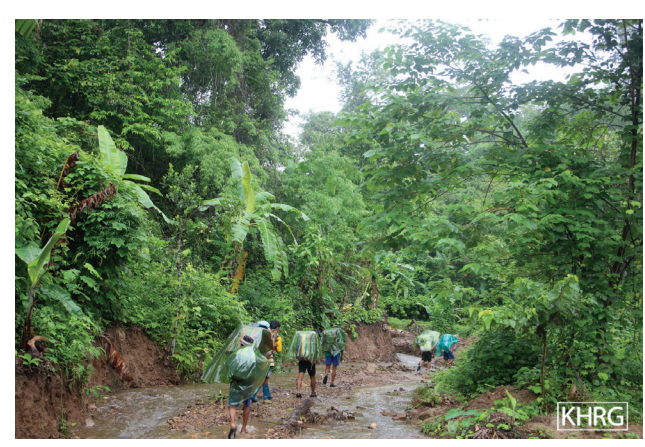
These photos were taken in Ei Tu Hta IDP camp and on a small path just outside of Ei Tu Hta IDP camp, Bu Tho Township, Mu Traw (Hpapun) District on June 15<sup>th</sup> 2017. The photos show IDP families who decided to return on their own to Ma Yah Hpin return site, Moo (Mone) Township, Kler Lwee Htoo (Nyaunglebin) District.

Although returns are typically categorised as either spontaneous or facilitated, the strategies actually employed by refugees and IDPs often combine a variety of elements. These strategies highlight both the agency of displaced populations in creating choice for themselves as well as certain weaknesses in the structure of current return facilitation programmes and their failure to fully address the essential needs of returnees.