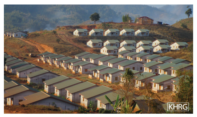
This photo is from a video taken of Kaw Lah village, Kaw T'Ree (Kawkareik) Township, Dooplaya District on February 6<sup>th</sup> 2020. Kaw Lah village is one of several designated repatriation/resettlement sites for returnees. Pictured is the Three Hundred Houses area where new housing was built for refugee and IDP returnees.