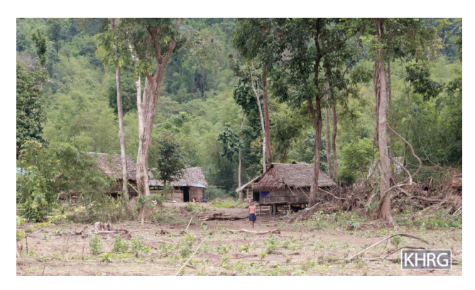
This photo was taken in Ma Yah Hpin village, Moo (Mone) Township, Kler Lwee Htoo (Nyaunglebin) District on June 24<sup>th</sup> 2017. The photo shows houses in Ma Yah Hpin village, where IDPs have returned.

Lack of confidence in the peace process, distrust in government administration, and feelings of being discounted by the current government were also expressed by returnees and serve as clear indicators that the historical realities of conflict and violence are not yet (but in need of) being addressed as part of repatriation and reintegration initiatives. By calling attention to these problems, the current report highlights the challenges faced by returnees so that actions can be taken to better promote their sustainable and dignified return. Throughout this report, KHRG privileges the lived experiences of return to amplify the concerns of returnees, whose voices should be taken into account by the Myanmar government and relevant ethnic armed organisations and aid providers.