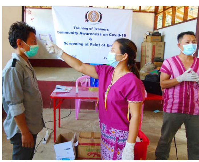
KDHW providing TOT about Covid-19 awareness raising

Kaw Kya Thel (Toe Bo Lay) is another mixed-control area in central Doothahtoo district. On April 30, two