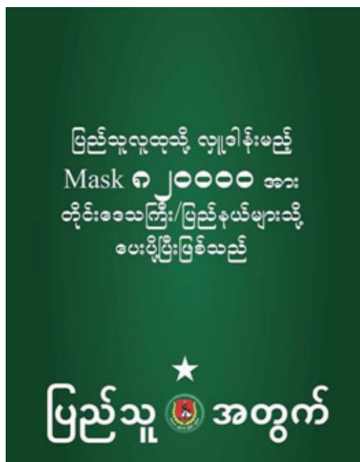
“820,000 masks have been sent to the respective regions/states as donations for the people. For the People (with USDP logo)” Posted on 8 April 2020.

home also in Naypyidaw and distributing military-made soaps, hand sanitizer gels and green face masks – the color associated with the Myanmar military – in monasteries and a hospital in Mandalay, as well as in Patheingyi, in Irrawaddy Region.