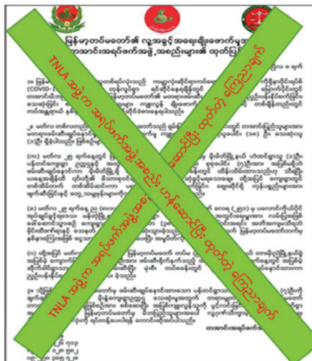
A Ta’ang civil society statement dismissed as TNLA propaganda on 8 April 2020.

The aforementioned Ta’ang CSOs’ statement was re-printed on the Pyidaungsu Tatmadaw Facebook page on the day it was released, but with a large “X” superimposed over the text. It alleged that the statement had made false accusations and had been written by the TNLA “pretending” to be civil society. Before and since the 8 April statement, most of the page’s posts have been attempts to delegitimize the AA. The shift to condemn Ta’ang civil society organizations could indicate a broader perception of who is considered an enemy of the state. The allegation that Ta’ang civil society actors and activists are TNLA agents mirrors the pattern used by the government and military to target journalists and ethnic media for perceived links to the AA.