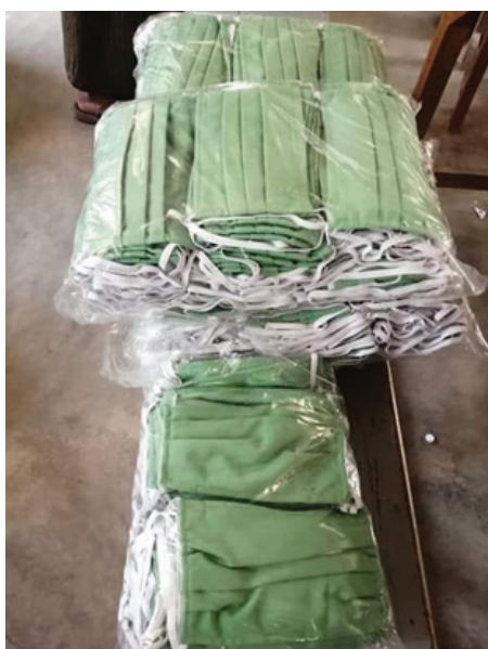
Face masks made in a military garment factory, shared on social media on 6 April.