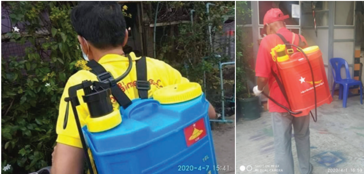
A man sprays a cannister filled with disinfectant and marked with the logo of the National Democratic Force (L) and the NLD (R). Posted on 8 April 2020.

Throughout March, the military also maintained a public relations campaign of its COVID-19 prevention efforts. This involved a range of activities including, but not limited to, soldiers spraying disinfectant in the homes of retired military officials in Karen State, the Naypyidaw general hospital, and a nursing