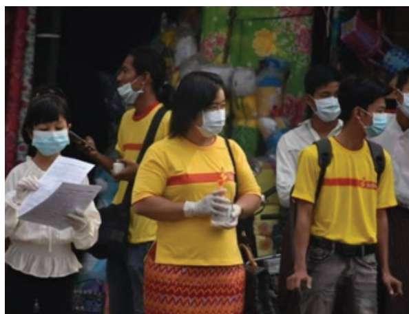
From left, bleach disinfectant canisters marked with the USDP logo; people wearing t-shirts representing the People’s Party distribute hand sanitizer. Posted on 8 April 2020.