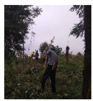
Villagers forced to fence Burma Army base

On November 4, each village was ordered to provide wood or bamboo poles (2.5 meters long) to build fences around the new base. Large villages (of over 50 households) had to provide 25 poles, and smaller villages (of under 50 households) 15 poles. Again, one member of each household in each village had to go and cut down bamboo and wood, and bring it to the headman's house. When they had collected the required amount, the villagers had to carry the wood to the base, either on foot or by truck. Then they were forced to work erecting spiked fences around the new base: one inner fence and one outer fence. Each village was allocated a specific length of fencing which they had to complete. For most villages, it took three days of work to finish the fencing. They had to go to work at 8 am in the morning and finish at about 4 pm. They were not provided with any food or water.