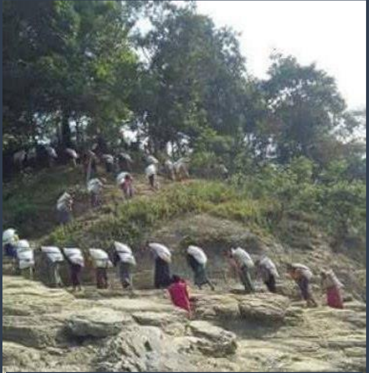
Figure 1 IDPs and local civilians being used as porters.

These concerns proved to be justified as by June, 2019 CHRO was documenting widespread and systematic use of civilians constituting forced labour in the reinforcement of the 77 th Light Infantry Division stationed in Khamaungya Village, Paletwa. 66 Whole Villages and members of IDP communities, including the elderly were regularly engaged in a supply line connecting Khamaungya Village and Paletwa Town, via Miza by boat and Cuanchaungwa by foot. The 15 Mile journey between Khamaungya and Cuanchaungwa by foot takes approximately 4 hours. Village Administrators who were instructed to provide up to 20 people at a time on multiple occasions from February 2019 to May 2019 informed CHRO that they were afraid to reject orders for fear of retaliation. 67