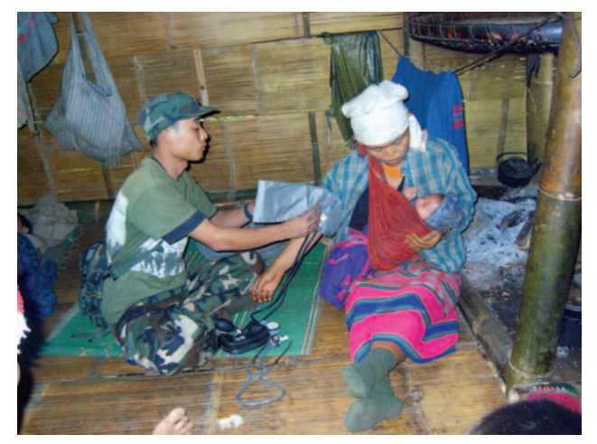
This picture was taken on August 4<sup>th</sup> 2006 in Lu Thaw Township, Hpapun District. This woman delivered her child while being displaced in the forest. She is receiving care from a field medic.