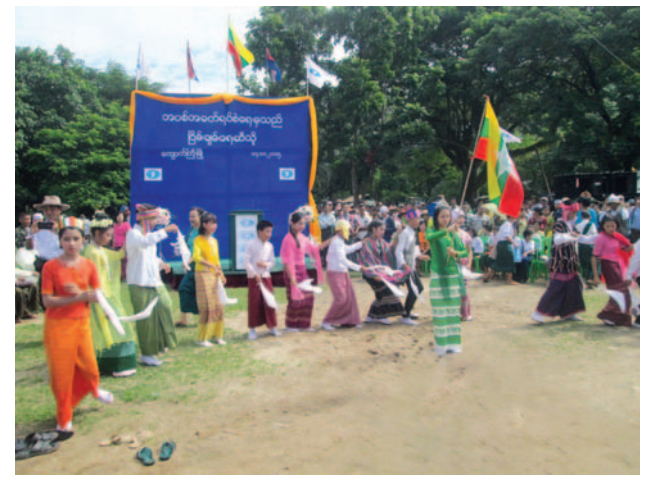
This photo was taken on October 14<sup>th</sup> 2015 in Ler Doh Town, Kyaukkyi Township, Nyaunglebin District. It shows more than 4,000 villagers from Mone, Kyaukkyi and Shwegyin townships gathering together to celebrate the upcoming signing of the Nationwide Ceasefire Agreement.