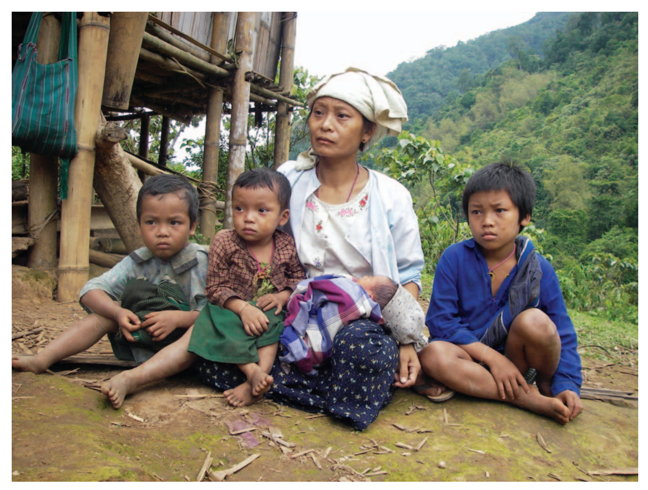
This photo was taken in May 2006 in Lu Thaw Township, Hpapun District. It shows a widow with four children at a displacement site. Her husband was killed by Tatmadaw soldiers in 2006.

This report presents their perspectives on changing patterns of abuse, set against historical trends in Southeast Myanmar, as well as on access to justice and remedies for past and present human rights violations. In order to understand some of these changes, KHRG focused on asking villagers about their lives in the context of the 2015 NCA. However, it should be understood that many of the changes in terms of military behaviour and human rights abuses actually date back to the 2012 Preliminary Ceasefire Agreement. The report refers to both agreements throughout, in part as a reflection of the fact that many villagers see the two as part of one on-going process.