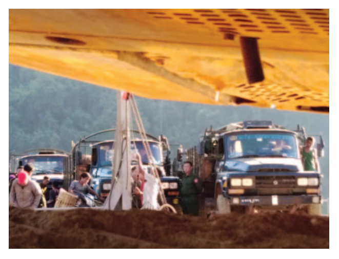
This photo was taken in December 2017 in Htantabin Township, Toungoo District. It shows Tatmadaw trucks sending more food and more soldiers to Hkler La and Kaw Thay Der army camps.