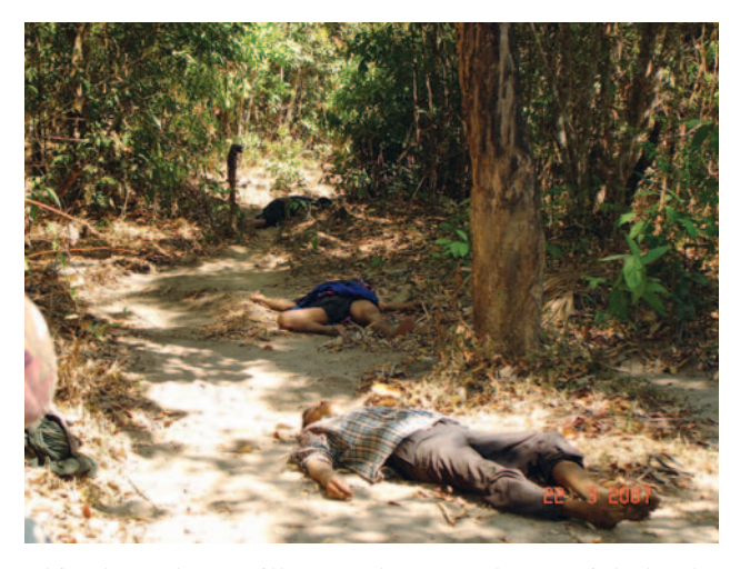
This photo shows villagers who were shot on sight by the Tatmadaw in the Plah Day Th'Dah area, Hpapun District on March 21<sup>st</sup> 2007.

Section A - Overview highlights how the Tatmadaw carried out systematic attacks against Karen villages and subjected civilians in conflictaffected areas to a wide range of human rights violations. These included killings, torture and other inhumane or degrading treatment, the use of widespread sexual violence against women as a weapon of war, and destruction of property. The Tatmadaw also consistently used civilians as an unpaid labour force, including for military purposes, often subjecting victims to violence, threats and life-threatening conditions. It also engaged in looting and extortion, as well as in land confiscation along with other Myanmar government agencies.