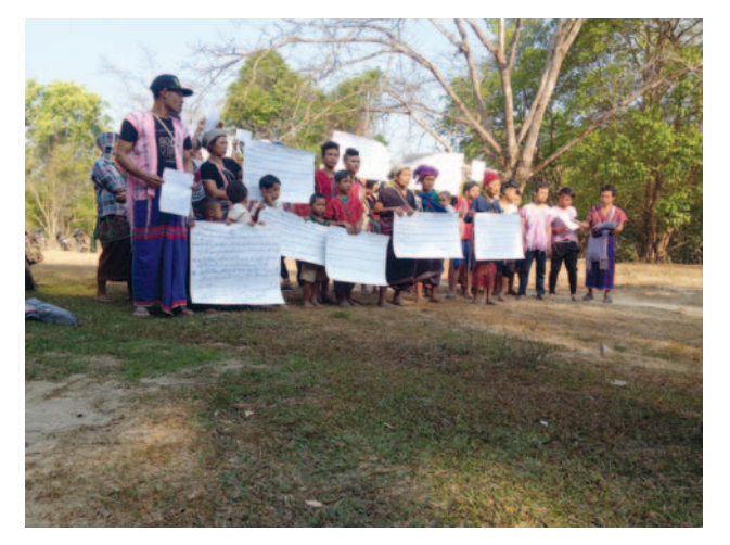
This photo was taken in Kheh Der village tract, Kyaukkyi Township, Nyaunglebin District on March 21<sup>st</sup> 2019. It shows villagers from Kheh Der village tract demonstrating against a Tatmadaw road construction project.