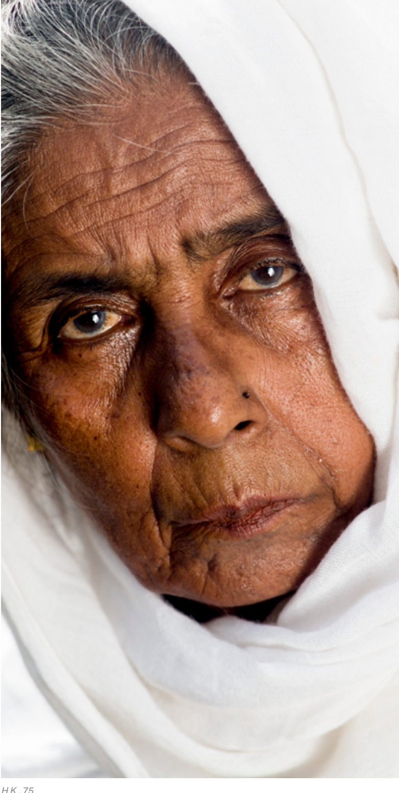
H.K., 75. ©Saiful Huq Omi, Counter Foto, Cox's Bazar District, Bangladesh, August 2019