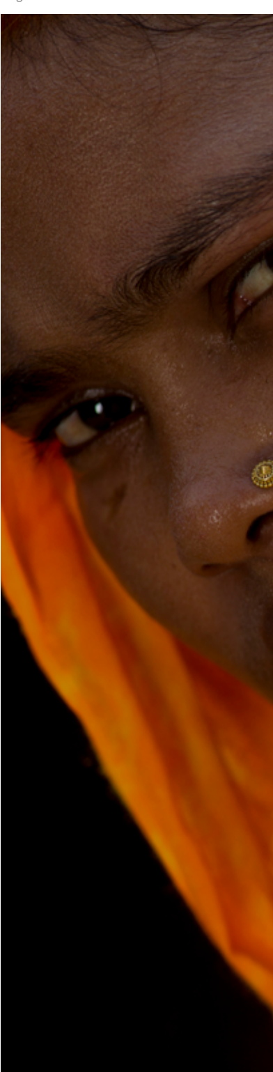
"F.Z.," 25. ©Saiful Huq Omi, Counter Foto, Cox's Bazar District, Bangladesh, August 2019