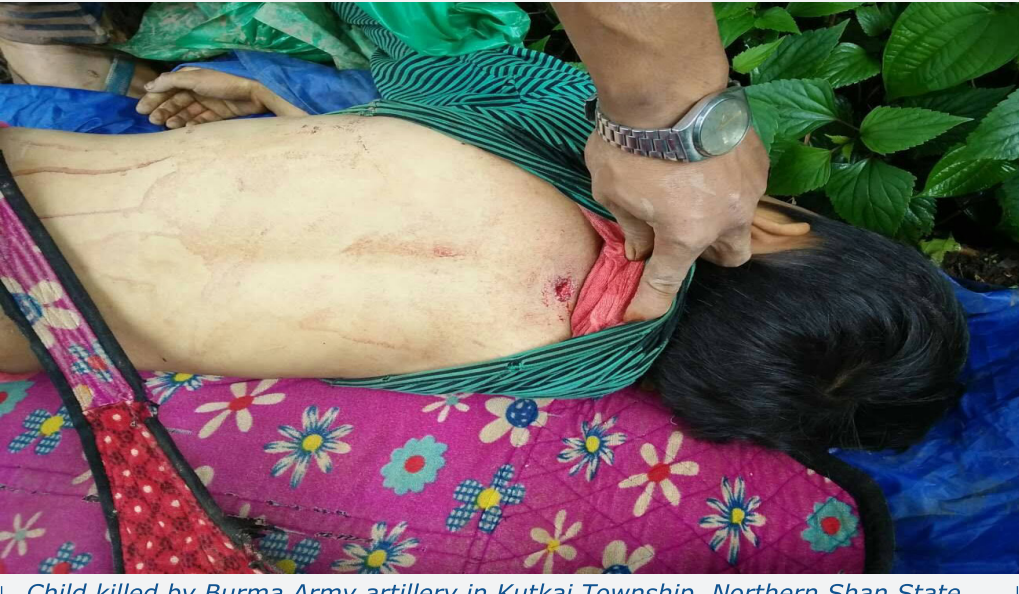
Child killed by Burma Army artillery in Kutkai Township, Northern Shan State.

On the morning of 28 June, Burma Army LID 88 shelled TNLA soldiers stationed near M--- village, Kutkai Township, Muse District, northern Shan State. According to one villager, "Burma troops started shelling from above the monastery, hitting the houses. Burmese troops brought cars and motorcycles to send injured villagers to Kutkai hospital. Villagers received serious injuries and were very scared."