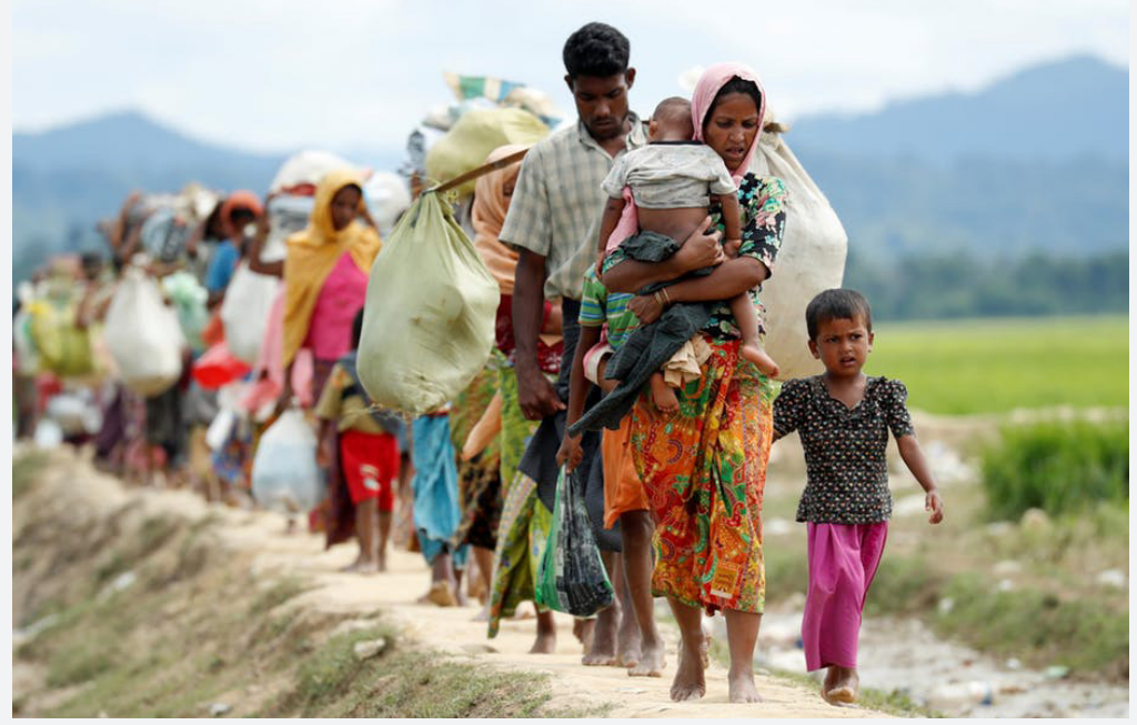
Muslim refugees walk from Myanmar to refugee camps in Bangladesh.

directly to the sanctions but allowed one of the sanctioned generals to resign, while another was dismissed for apparently unrelated reasons.