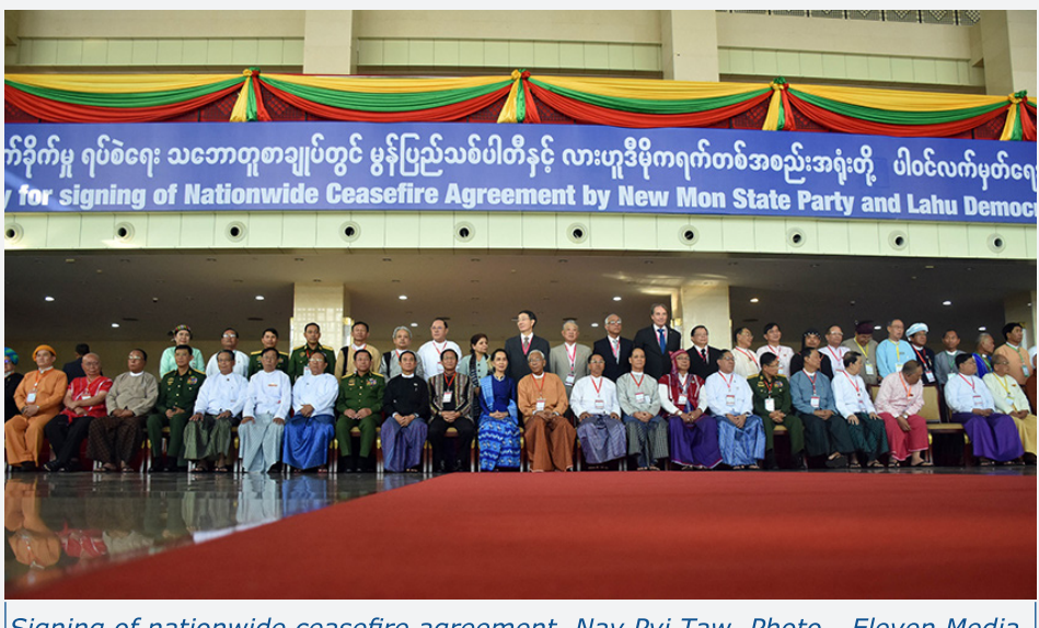
Signing of nationwide ceasefire agreement, Nay Pyi Taw.

In October, a two-day summit was held between the government and EAOs signatory to the NCA, setting guidelines for the discussion of two key unsettled points in the negotiations: non-secession from the union and the formation of a unified army. The 4th session of the 21st Century Panglong agreement is scheduled for early 2019.<sup>19</sup>