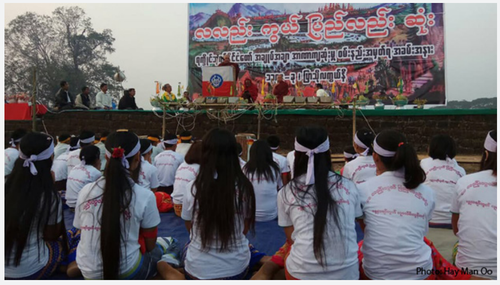
Annual event commemorating the fall of the Arakan Kingdom, January 16, 2018.

In October, two editors and a journalist from Eleven Media Group were arrested and held at Insein Prison after the Rangoon government filed a suit accusing them of reporting incorrect information regarding the city's budgeting and spending of public funds.<sup>25</sup> Despite an order from the President's Office for the Rangoon city government to comply with the Media Law requiring them to attempt to settle disputes outside of the court system first, the city government declined to drop the case, demanding a published apology by Eleven Media Group in government newspapers.