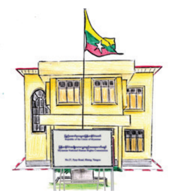
The Myanmar National Human Rights Commission, Yangon.

In practice, the selection process has been lacking transparency. A reshuffle in September 2014 resulted in the number of Commissioners being reduced from 15 to 11 and seven members being replaced.<sup>26</sup> These changes were made subsequent to the passing of the MNHRC Law earlier in the year and resulted in a replacement of the Commissioners that had been in place when the MNHRC's mandate was established by Presidential Decree in 2011. Significantly, none of the members who were replaced were aware of the process and one even questioned the legality of the reshuffle.<sup>27</sup> There was no clear indication regarding whether or not the Selection Board had been convened to appoint new Commissioners or if it had been instituted in a top-down process by then-President Thein Sein, or by another authority. This lack of transparency was also apparent in the recent appointment of three new Commissioners which was announced through a short statement on the Facebook page of the President's Office with no details regarding the selection process.<sup>28</sup> This contradicts the explicit stipulation in the General Observation that there must be "a clear, transparent, merit-based and participatory selection and appointment process".<sup>29</sup>