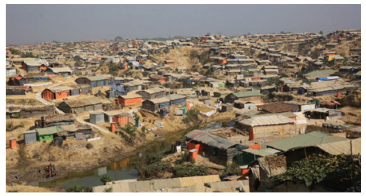
The Rohingyas are living in these rickety huts made of bamboo and plastic sheets in the Cox's Bazar refugee camps.

the situation of human rights in Myanmar.<sup>12</sup> Given the credible evidence of crimes against humanity that has been well documented by the UN and international and local human rights organisations, the failure of the MNHRC to even recognise the term Rohingya is shocking.<sup>13</sup> After a visit to the affected area, the MNHRC released a statement, using the word 'Bangali' throughout, focusing on the acts of the 'terrorist' group, the Arakan Rohingya Salvation Army, not once mentioning the horrific crimes committed by the Myanmar Military, and even recommending more security posts to be established in the area.<sup>14</sup> The GANHRI-SCA report "encourages the NHRC to interpret its mandate in a broad, liberal and purposive manner, and to promote and protect human rights of all including the rights of Rohingya and other minority groups".<sup>15</sup> Given the MNHRC's demonstrated refusal to recognise the term, 'Rohingya' and thus their right to self-identify, this is very unlikely.