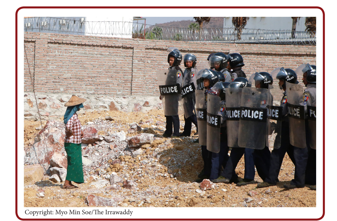
Case Study 1: Conflict-related human rights violations