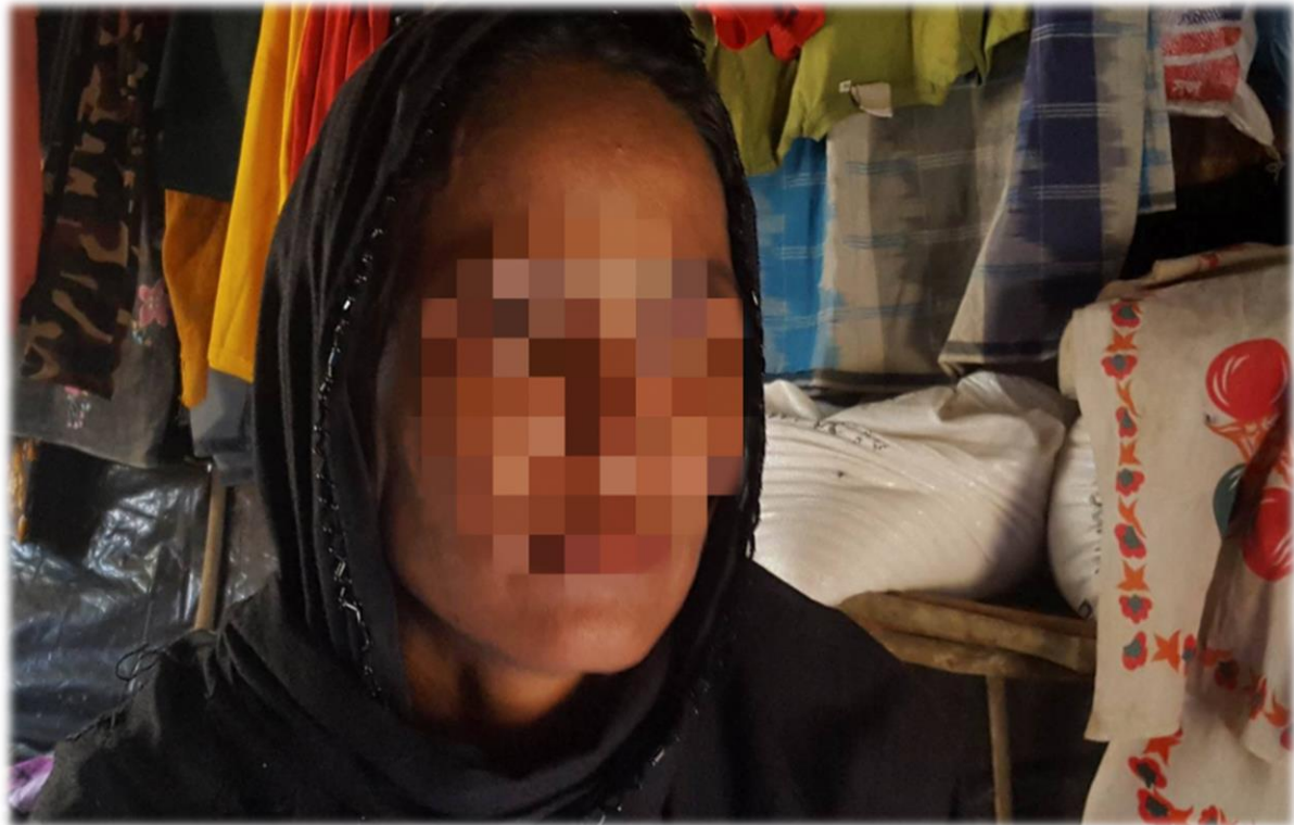
first rape victim

Describing her own abuse, the source said “the military came to our village around midnight. Three military men came to my house; one of them entered the house with a gun while the other two waited in front of the gate.”