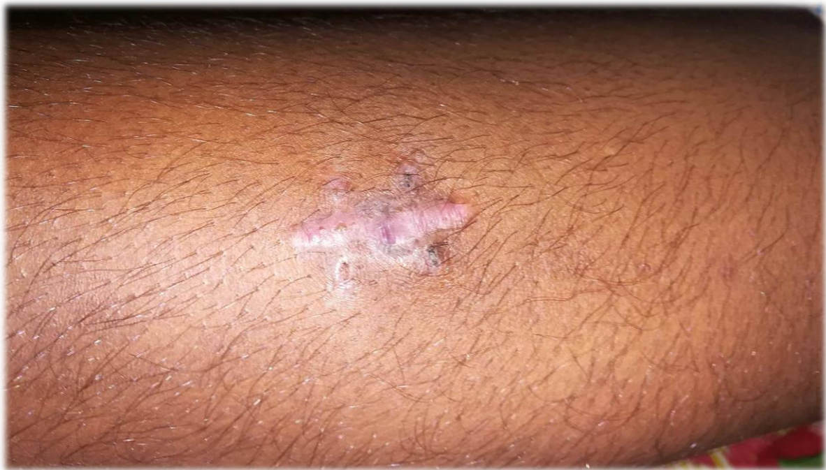
a 23-year-old man with a bullet injury in leg

Photographs of his wounds are displayed below.