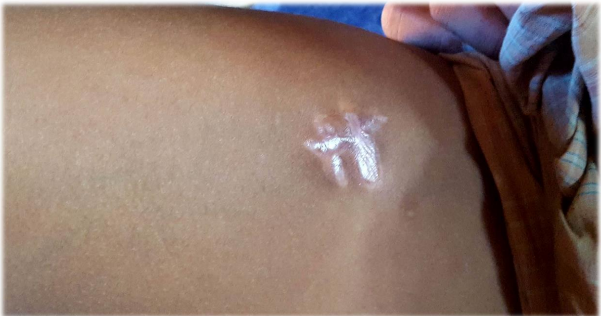
the 11-year-old victim with a bullet wound

BROUK has spoken to an organisation that confirmed it operated on the wound on his leg, which they identified as a gunshot injury.