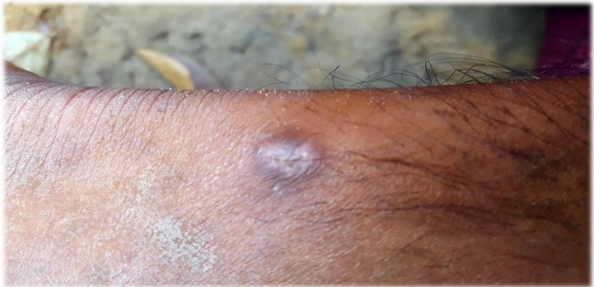
the 21-year-old victim with wound at the ankle

A doctor who reviewed the photograph above told BROUK that it appeared to be "arm scarring from a bullet graze wound with friction burns, likely from joint being bent when the bullet grazed the skin."