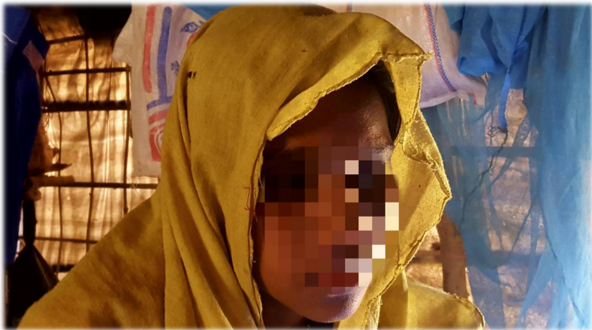
second rape victim

“A group of military men stopped me trying to leave the village. One of them took me inside my house and raped me,” she recalled. “Another soldier held my baby. When I managed to struggle free, I took my baby and ran,” she said.