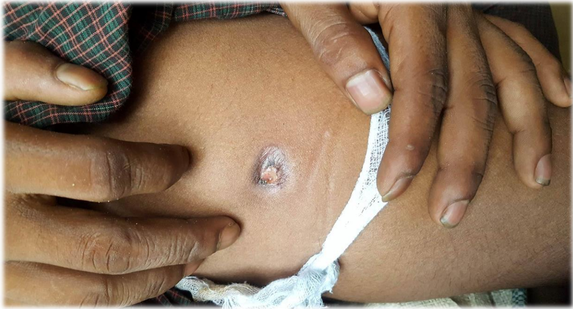
15-year-old victim with a gunshot wound

A twelve-year-old boy from Maungdaw Township told BROUK that he was shot by the military during an attack on his village in September. He arrived in Bangladesh later in that month.