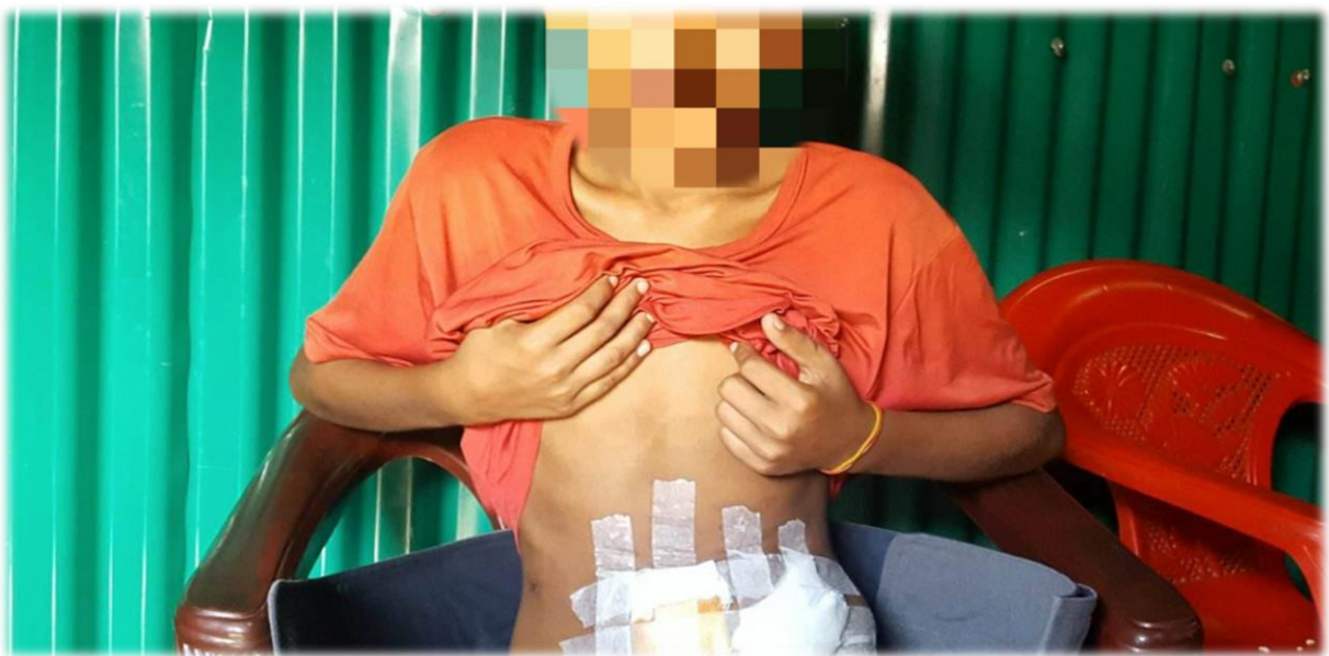
12-year-old victim displaying injuries from front

BROUK was able to make contact with the medics who treated the boy for his bullet injury, who confirmed he was shot.