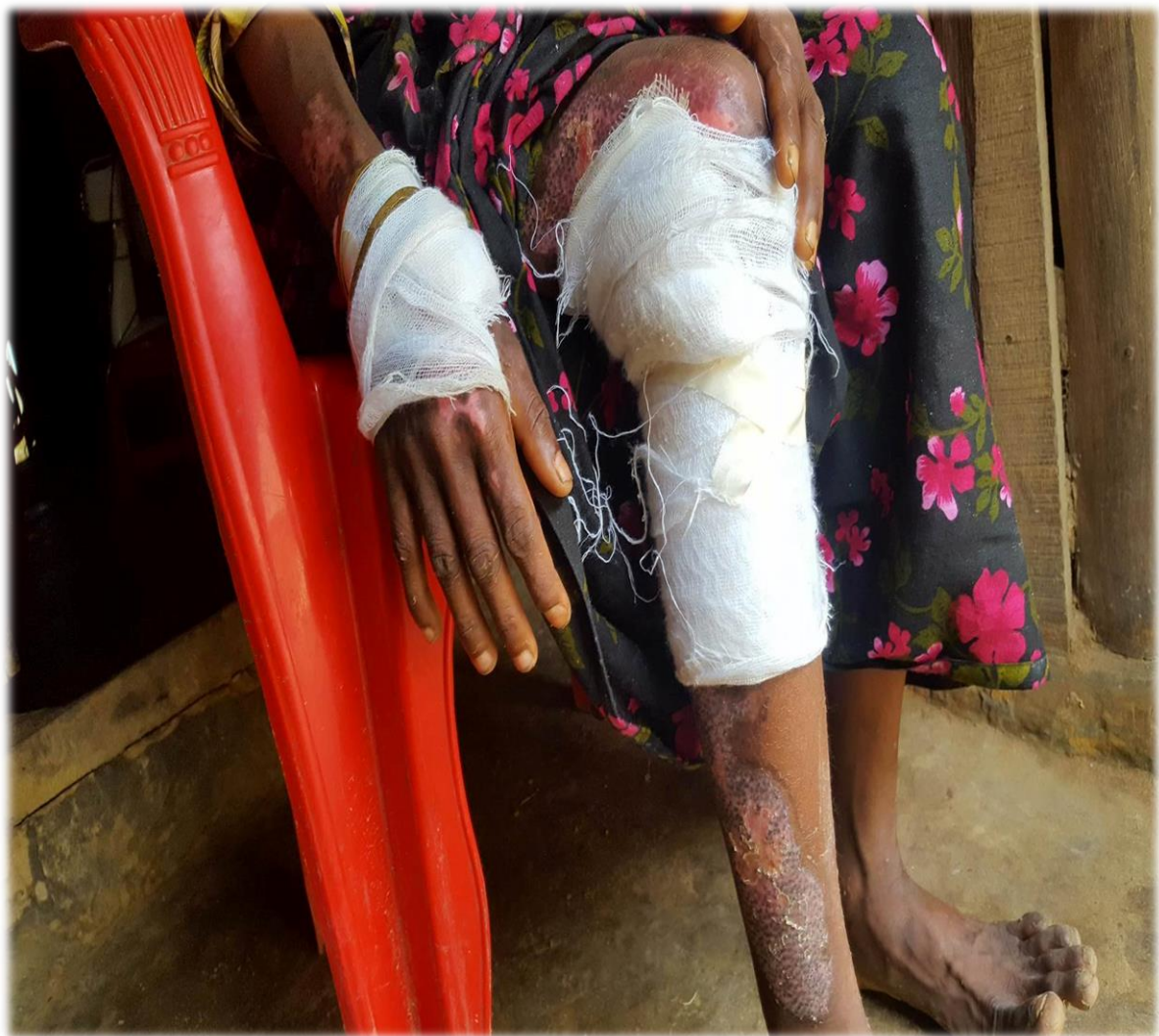
fourth rape victim with leg injuries

The victim had burn wounds to large parts of her body which she said she suffered when she was playing dead near bodies that were being immolated.