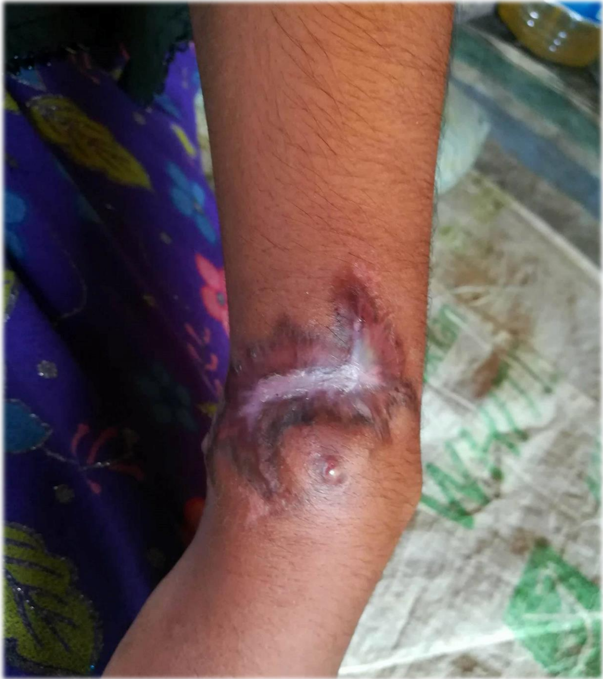
the 21-year-old victim with wounds to her arm

She fled and hid in a paddy field, she told BROUK. "Two hundred or more people were laying down, hiding from the bullets there," she recalled.