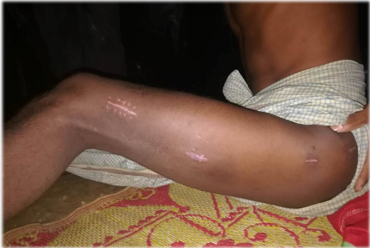
23-year-old victim displaying leg wounds

The wound in the first photo “appears to be around bullet or hot shrapnel entrance wound crossed by an incision,” alongside “four suture wounds”, according to a doctor who examined the image.