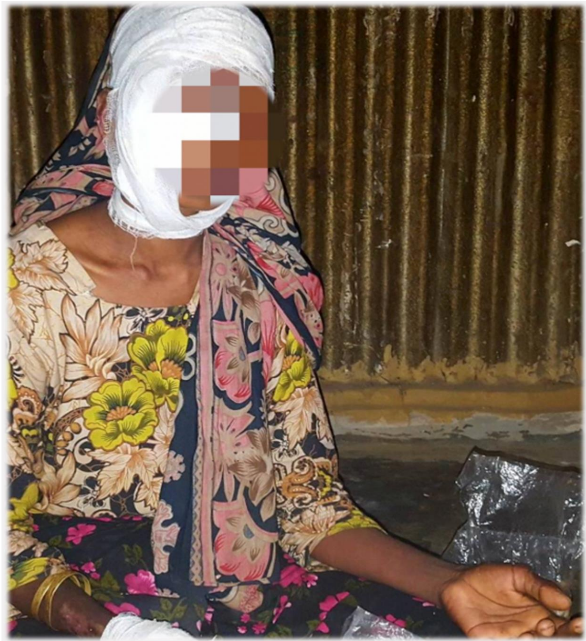
Fourth rape victim

“All the women sat near the river bank. And from there, the military took five of us and beat them. And then they stabbed to death those who were still alive,” she continued.