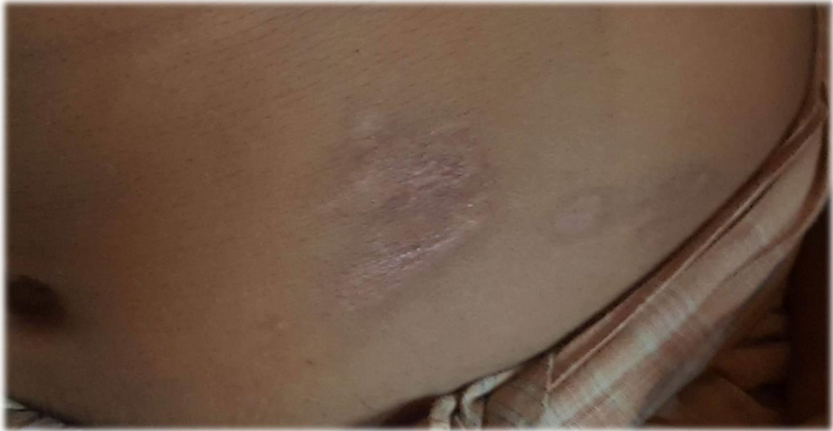
11 old victim with a graze

“I was also shot in my leg. I was treated in Bangladesh.”