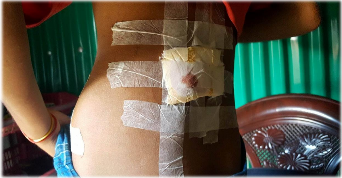
12-year-old victim displaying back injury

When asked if he had any connections to ARSA, he replied: “I heard the name ARSA but I don’t know anyone from the group. “