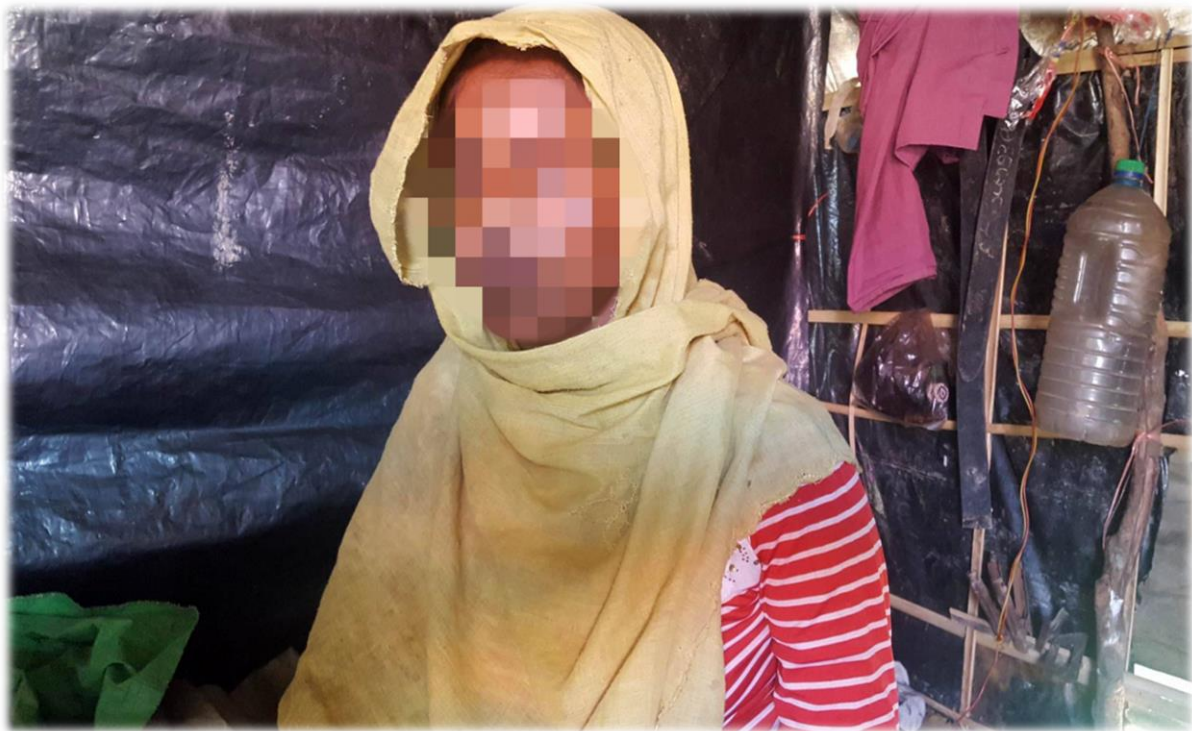
third rape victim

“Three military men came to the front of my house,” before they raped her, she recalled. “People everywhere were fleeing with children because of the shooting and stabbing. The military-led my children to run away but stopped me, took me inside my house and raped me.”