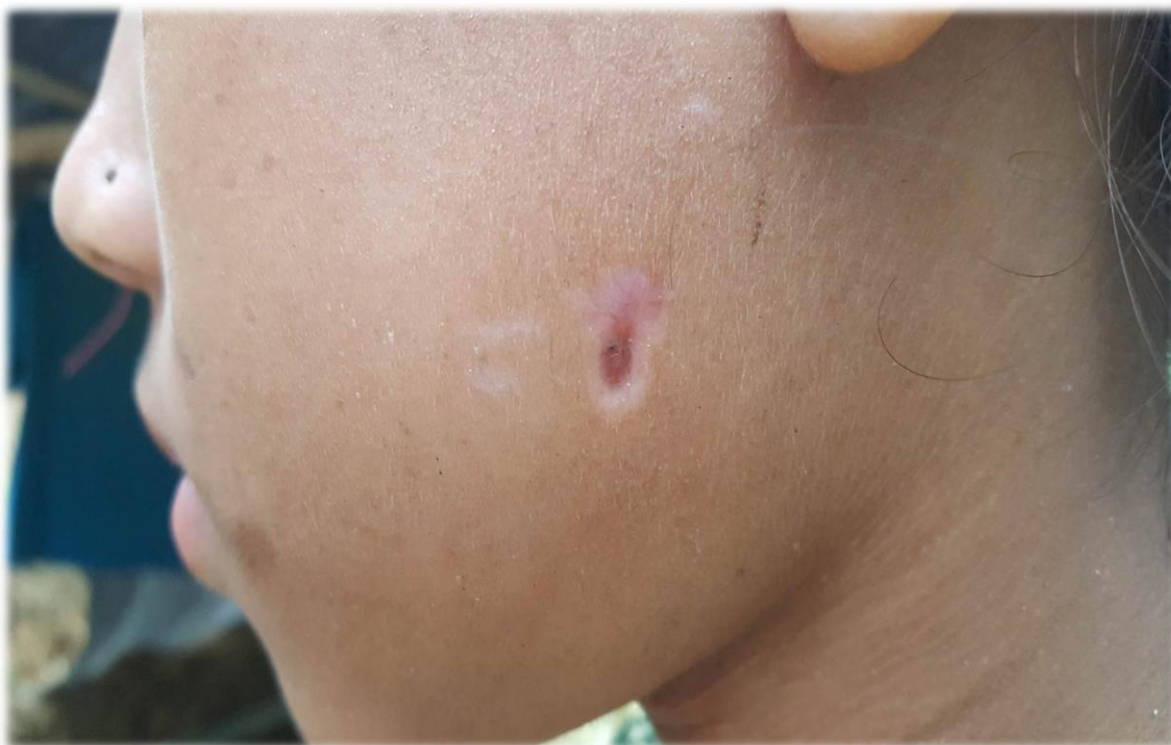
the 12-year-old victim with cheek wound

"I was shot in my house by a military bullet," she said. "At that time, the military seized the village and shot at people. When I was shot, I fell unconscious. I got treatment here [in Bangladesh] and in Myanmar."