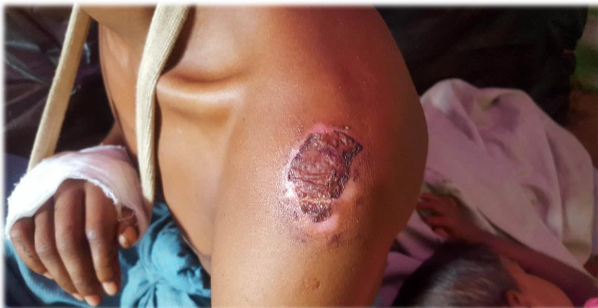
Shoulder injury to landmine victim

Regarding his other injuries, they observed that the leg wound looked like it was an “imprint injury” from the fragments of the mine, coupled with “burns from hot metal.”