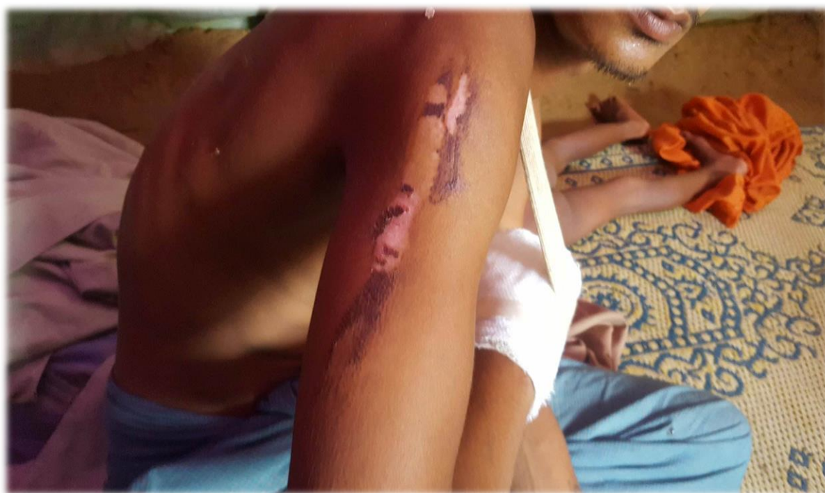
25-year-old landmine victim

“It took one day to come to Bangladesh [from my village],” he said. “I came here because of Rakhine mobs, security forces and military attacked us, shot us, stabbed us, burning down our houses. The military raped the mothers and sisters at night. Our houses were burned to ash. These are the reasons why we fled.”