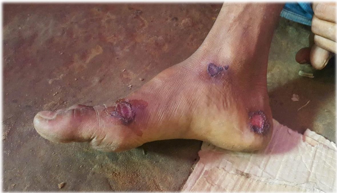
foot injuries in landmine victim

Continuing, he added: “A man was walking in front of me with a buffalo. The buffalo stepped on the mine and the mine flew in the air and fell far away. There was flame everywhere even though it was dark at the time. Many sparks and fragments struck me and I collapsed. I was unconscious for a time. When I came to, I realised that I had been brought to Bangladesh. My brothers took me to hospital. I feel better now.”