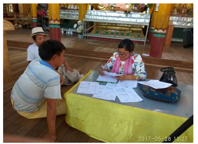
Villagers being interviewed by REM

Villagers also mentioned a large 200 feet-long crack that had recently appeared in the ground northeast of the Na Koon coal mine.