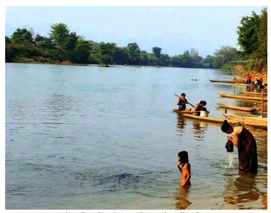
Nam Teng River in Lang Kho, southern Shan State

Locals are also worried about water pollution from the coal mining waste which may harm the fish and other creatures living in the Nam Teng and the streams flowing into it. They catch this fish for their own consumption.