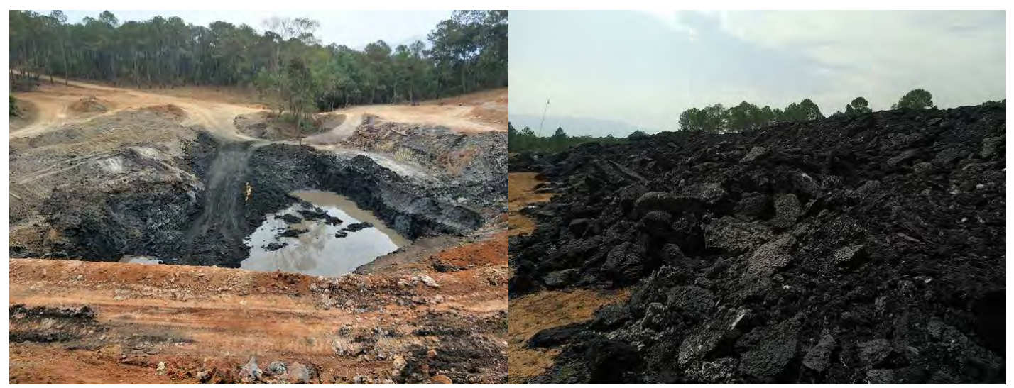
Coal mining site