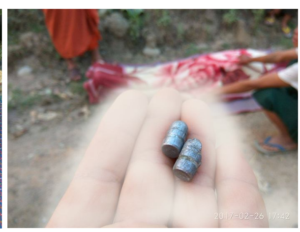
Bullets that hit Lung Jarm Phe