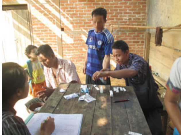
The above photos were taken by a KHRG community member and they show the medics from Burma/Myanmar health department coming to test the blood during collection of the list of malaria patients, on March 19<sup>th</sup> 2015, in Toungoo District, Thandaung Township, I--- Village. They are from Thandaung Township government health department and they arrived in I--- Village around 9:00 am, and announced that they would test for malaria. When the villagers came to have their blood tested, most of them were children who had malaria symptoms. The authorities said that the health programs are only able to take the list of the people who have malaria, and that they are not able to give vaccinations. The local people were unhappy, as they thought that they would be given vaccinations.

The villagers also reported to the KHRG community members that due to financial problems some pregnant women give birth to their children using a traditional midwife, instead of using a formally-educated midwife. If the Burma/Myanmar government healthcare department finds out the traditional midwives are practicing medicine, the midwives are fined at least 5000 kyat (US $3.77). If the pregnant women go to the hospital to give birth, they are well taken care of only when they offer the midwives money or property. If they are not given money, for instance if villagers face financial problems, the patients are told they have recovered and are then discharged from the hospital.<sup>26</sup>