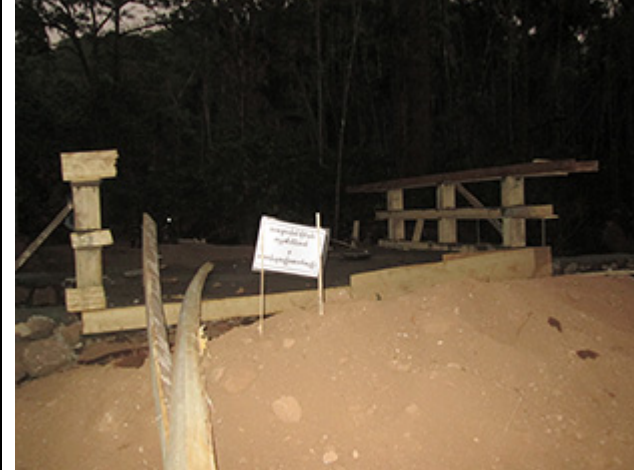
The first photo shows a signboard regarding road construction that was erected by Chan Mya Way Si Company, in Thandaunggyi Township, Toungoo District, taken on July 11<sup>th</sup> 2015. The signboard reads that the company is constructing the road between T--- and S--- villages. The second photo was taken on July 6<sup>th</sup> 2015 between T--- and H--- villages, Thandaunggyi Township. The photo shows one of the bridges and roads that were constructed by La Thitsa Pan Ka Maing Nin Company in the summer of 2015.